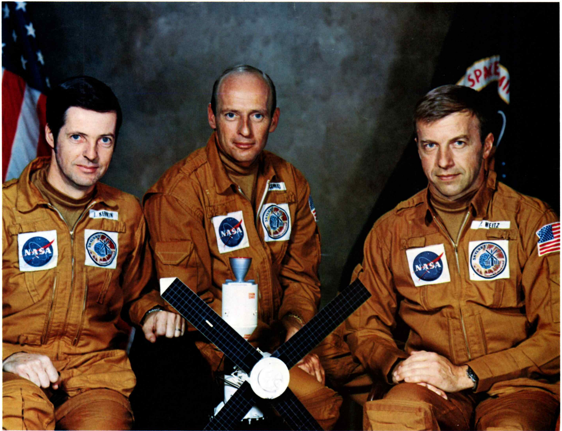
PRIME CREW OF FIRST MANNED SKYLAB MISSION Joseph P. Kerwin Charles Conrad, Jr. Paul J. Weitz