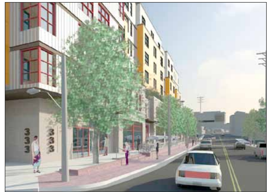
A rendering of the approved Shortbread Lofts project depicting the view down West Rosemary Street toward Carrboro.