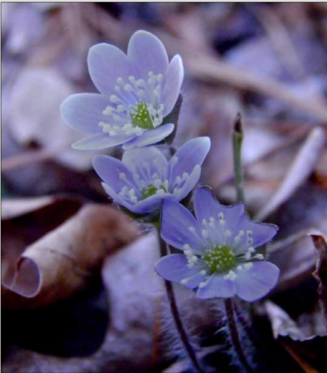
Harbinger-of-spring heptica appeared three weeks ago along Bolin Creek.