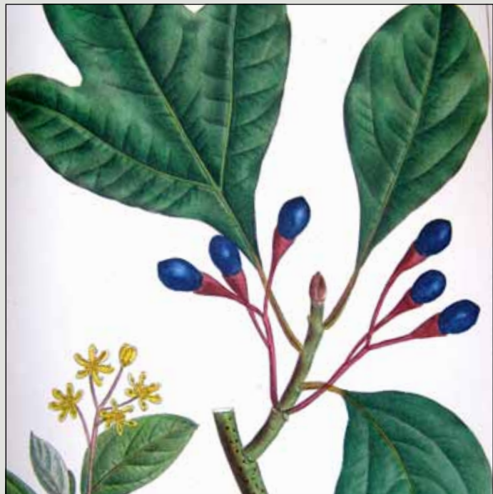
This beautifully illustrated sassafras from Michaux's The North American Sylva is accompanied with detailed description of its natural distribution, medicinal and culinary merits and recommendations for cultivation.

Various editions of Michaux's The North American Sylva , describing 156 species of native trees, illustrated by paintings of the team of Pierre J. Redoute, his brother Henri-Joseph and colleague Pancrea Bessa, are botanical treasures in rare book col-