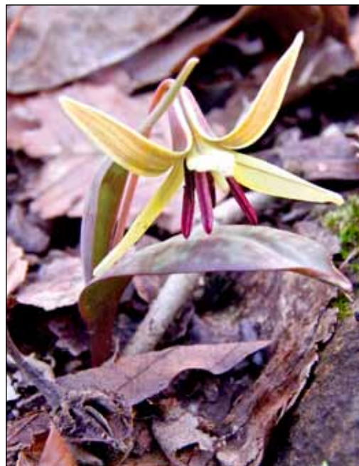
This trout lily was spied along Bolin Creek three weeks ago.