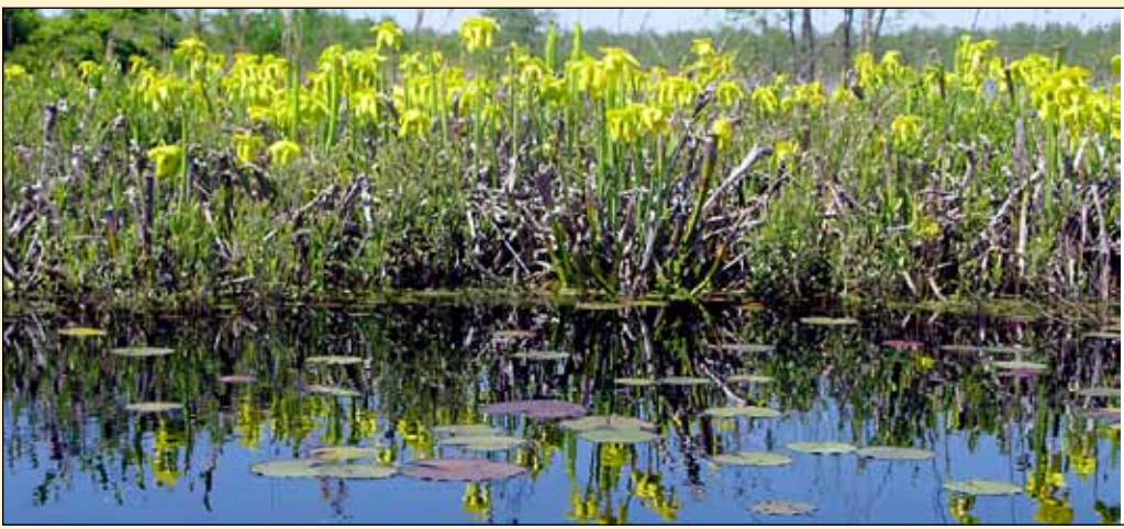
Floating mats of trumpet pitcher plants rim Horseshoe Lake.