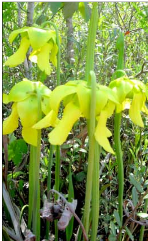
Trumpet pitcher plants flower before their leaves mature.