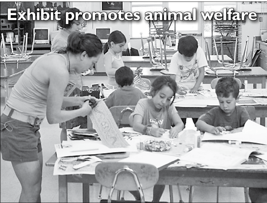
Exhibit promotes animal welfare