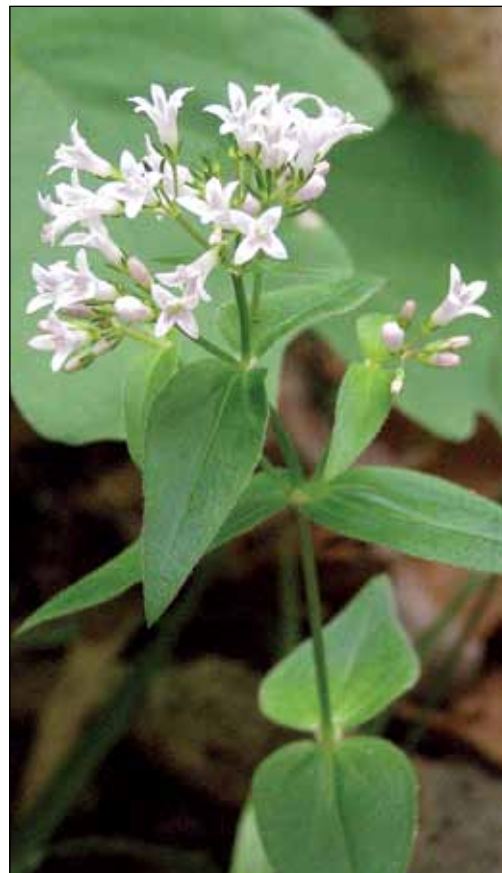
Summer bluets in full flower on the way down to Bolin Creek.