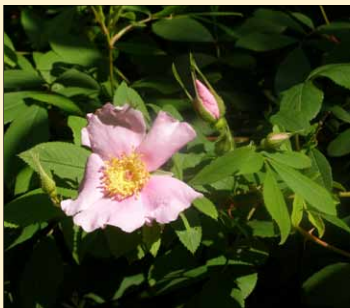
Look for swamp rose in wet ditches and on pond edges.