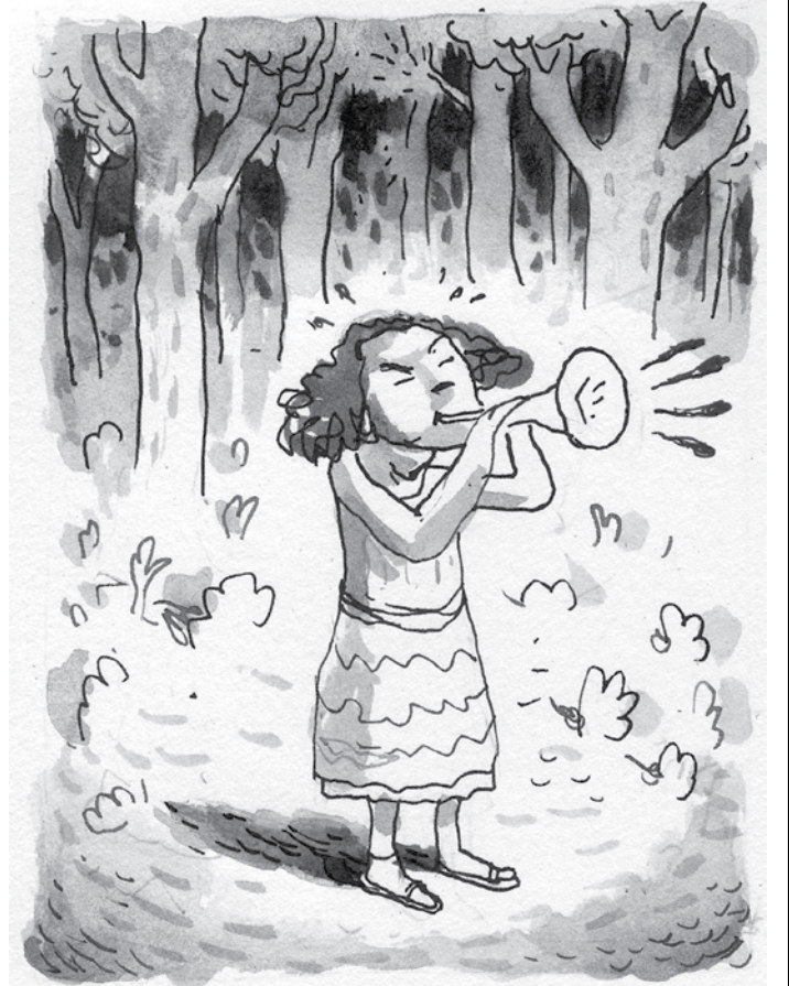
SUMMER ARRIVES ON MARY STREET.