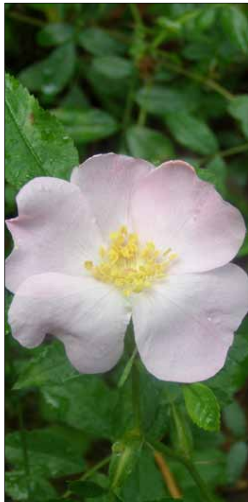
Single-petaled Carolina rose is found along forest edges.