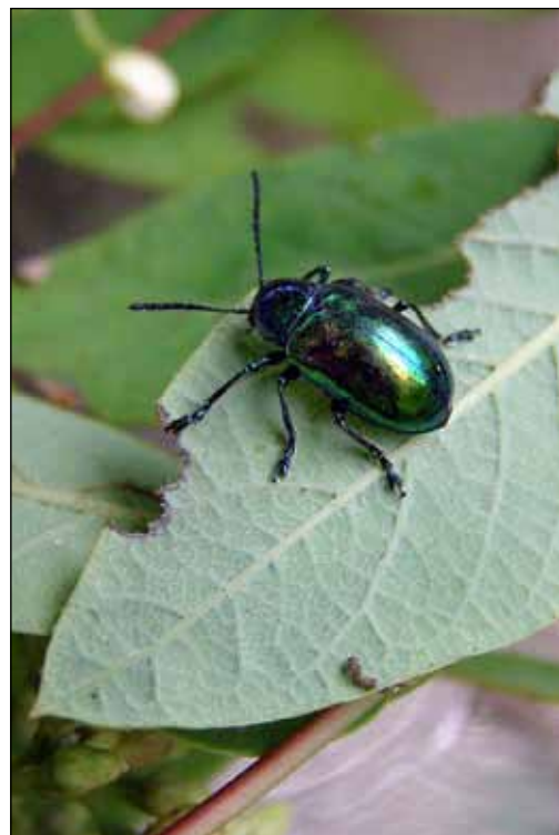
Though not a pollinator, the iridescent dogbane beetle depends on Indian hemp to survive.