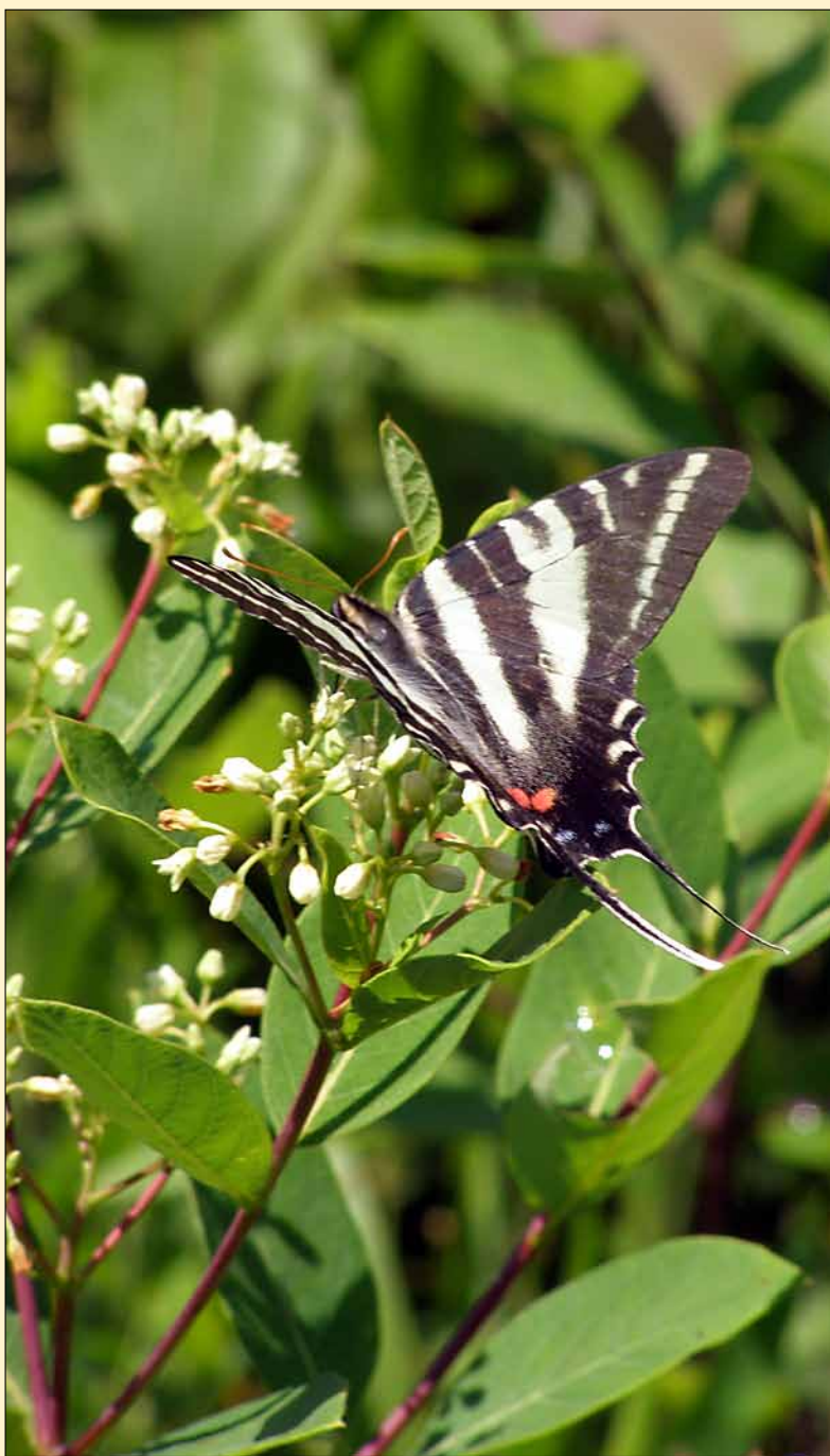
The zebra swallowtail is one of many pollinators of Indian hemp.