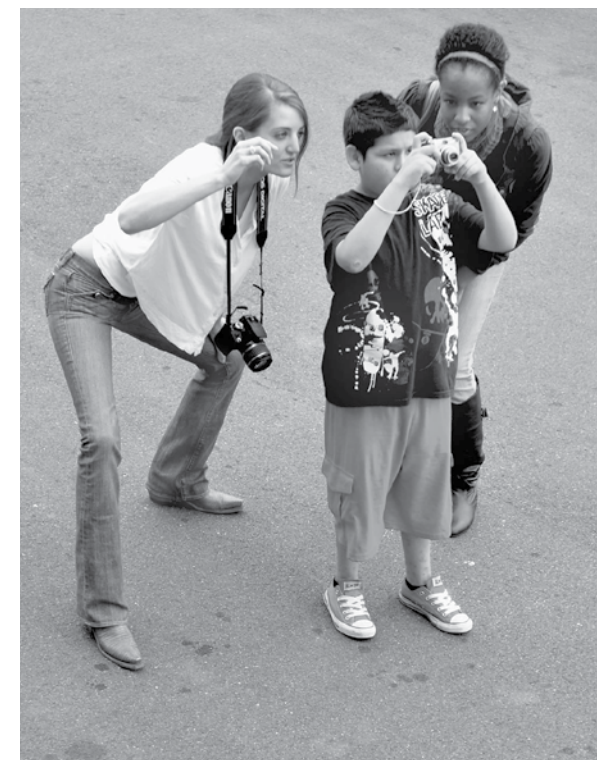
Paying it forward, 2010