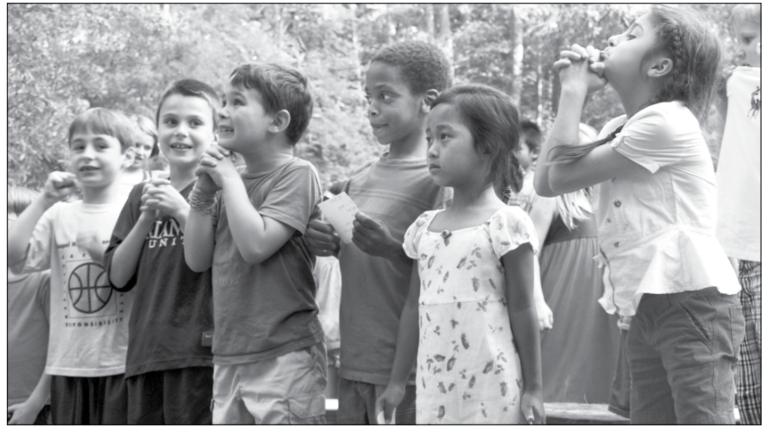
First graders at Carrboro Elementary School sing and dance to celebrate the publication of their guidebook, The Trees of Carrboro Elementary , in the amphitheatre at Carrboro Elementary on Tuesday.