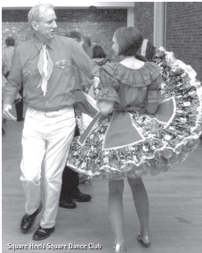
Square Heels Square Dance Club

Square Dance — Square Heels Square Dance Club classes begin Feb 6, 7:30-8:30pm at Binkley Baptist Church. $40 per person for 10 week package, 542-3708