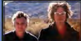
GARY LOURIS & MARK OLSON

WE 2/11 EARLY SHOW 7:30PM FROM THE JAYHAWKS