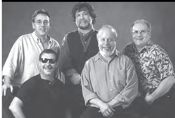
The Radiators 6/5