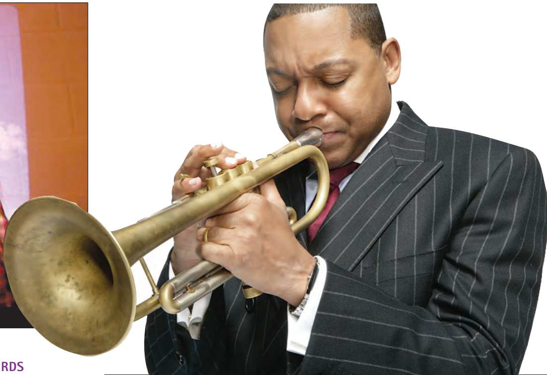
WYNTON MARSALIS 1/18 MEMORIAL HALL