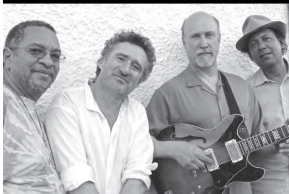
John Scofield Piety Street Band 4/18