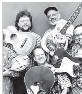
AUSTIN LOUNGE LIZARDS 1/10 THE ARTSCENTER