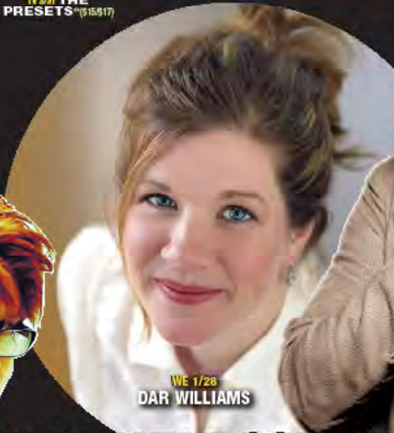
WE 1/28 DAR WILLIAMS