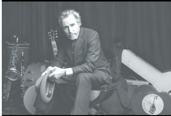
JD Souther 2/12