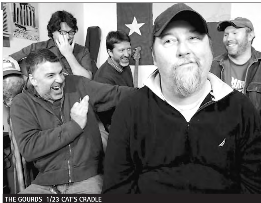
THE GOURDS 1/23 CAT'S CRADLE