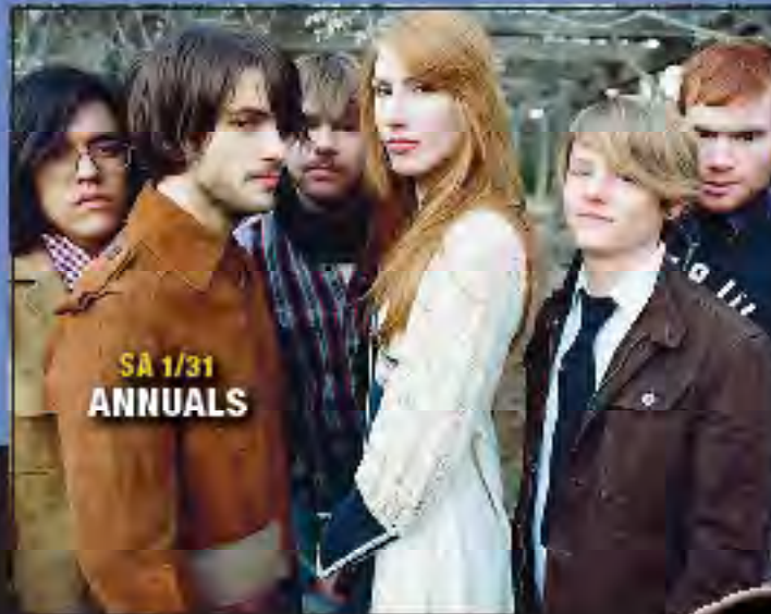
SA 1/31 ANNUALS