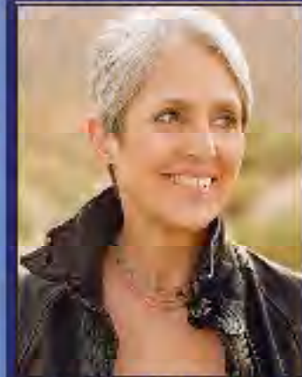
SA 2/28 JOAN BAEZ TIX/VA THEATRE BOX OFFICE OR CAROLINA.THEATRE.ORG