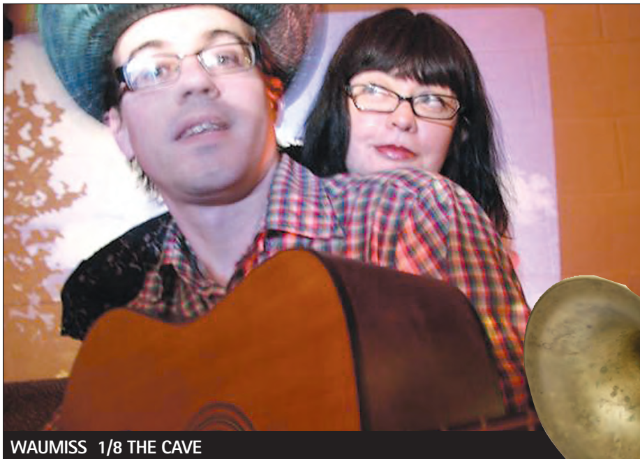
WAUMISS 1/8 THE CAVE