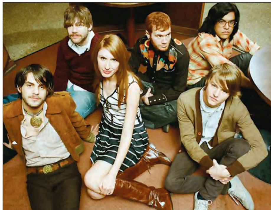
ANNUALS 1/31 CAT'S CRADLE