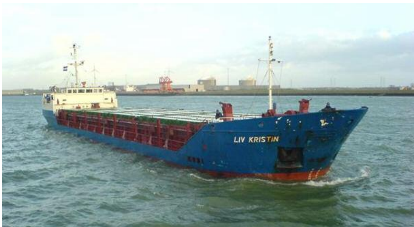
Vaage Ship Management's mv "Liv Kristin" (technical managers; Technical Ship Support), seen arriving at "Verbrugge Terminal", Flushing.