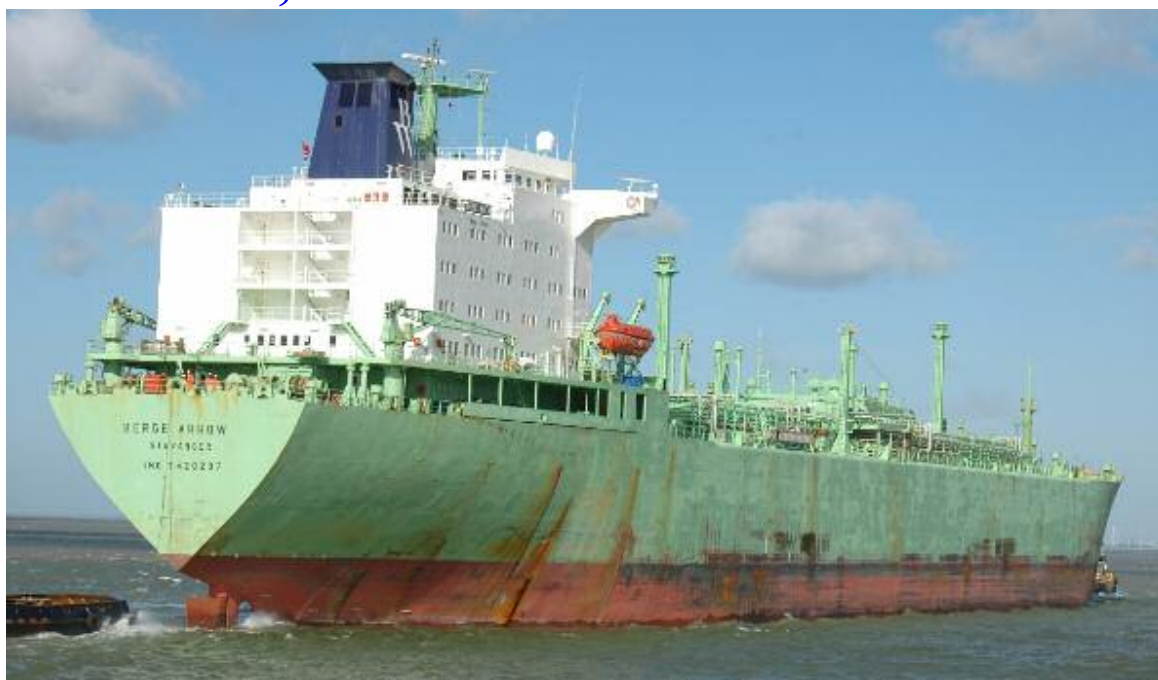
The BERGE ARROW seen at the Westerscheldt river – Photo : Henk de Winde ©