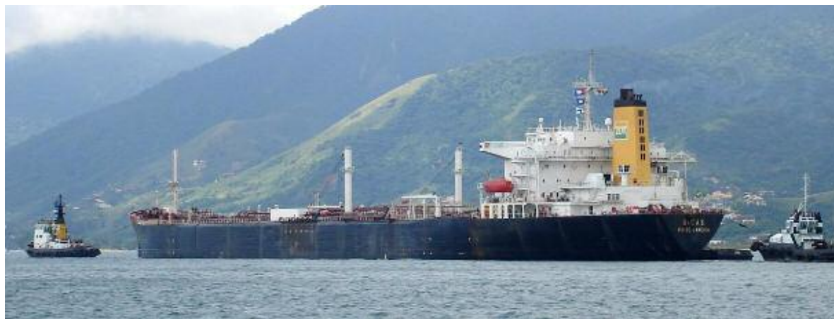
The BICAS arriving in São Sebastião-Brazil