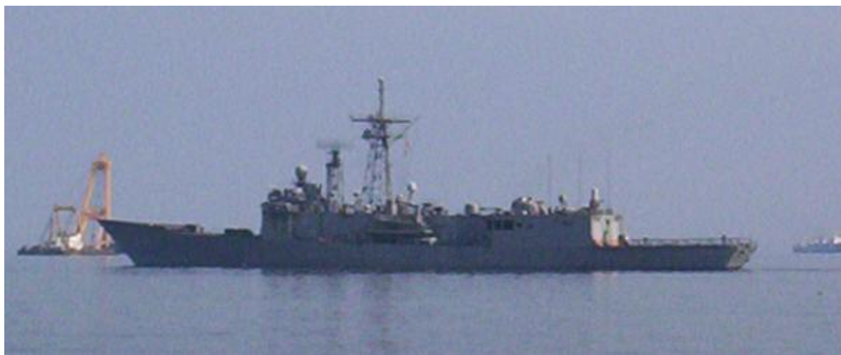
The 1983 built US Navy Perry class frigate FFG 49 Robert G. Bradley seen departing from the Peruvian port of Callao