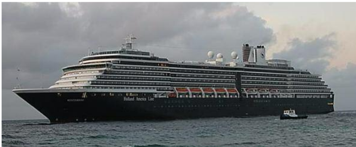
The WESTERDAM seen arriving in Willemstad (Curacao)

Located in the Kop van Zuid section of Rotterdam on Wilhelmina Pier, the new office will eventually house approximately 30 Holland America Line staff members, responsible for shipboard hiring, purchasing, and sales and marketing. The new office is only 100 meters from the site of Holland America Line's original office on Wilhelmina Pier in what is now Hotel New York.