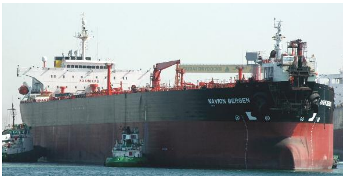
The NAVION BERGEN seen at Dubai Drydocks