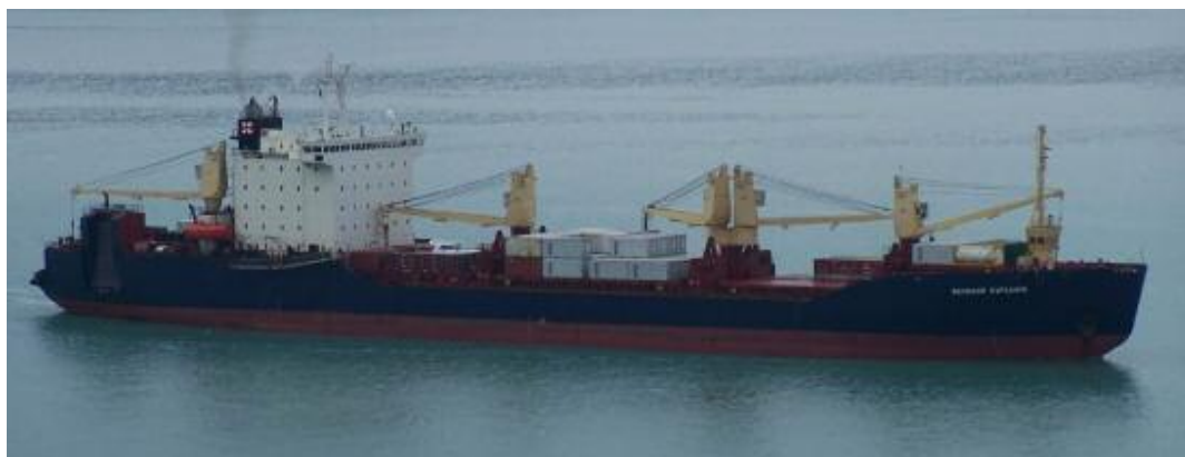
The Russian flagged Vasily Burkhanov has recently been taken on charter by Swire. The ship will operate a service from New Zealand ports to Australia and return.

The MPA said that the other consortium partners for the S$1.92 billion (US$1.27 billion) project include Penta Ocean Construction, Koon Construction & Transport Co Pte Ltd, and Van Oord in The Netherlands.