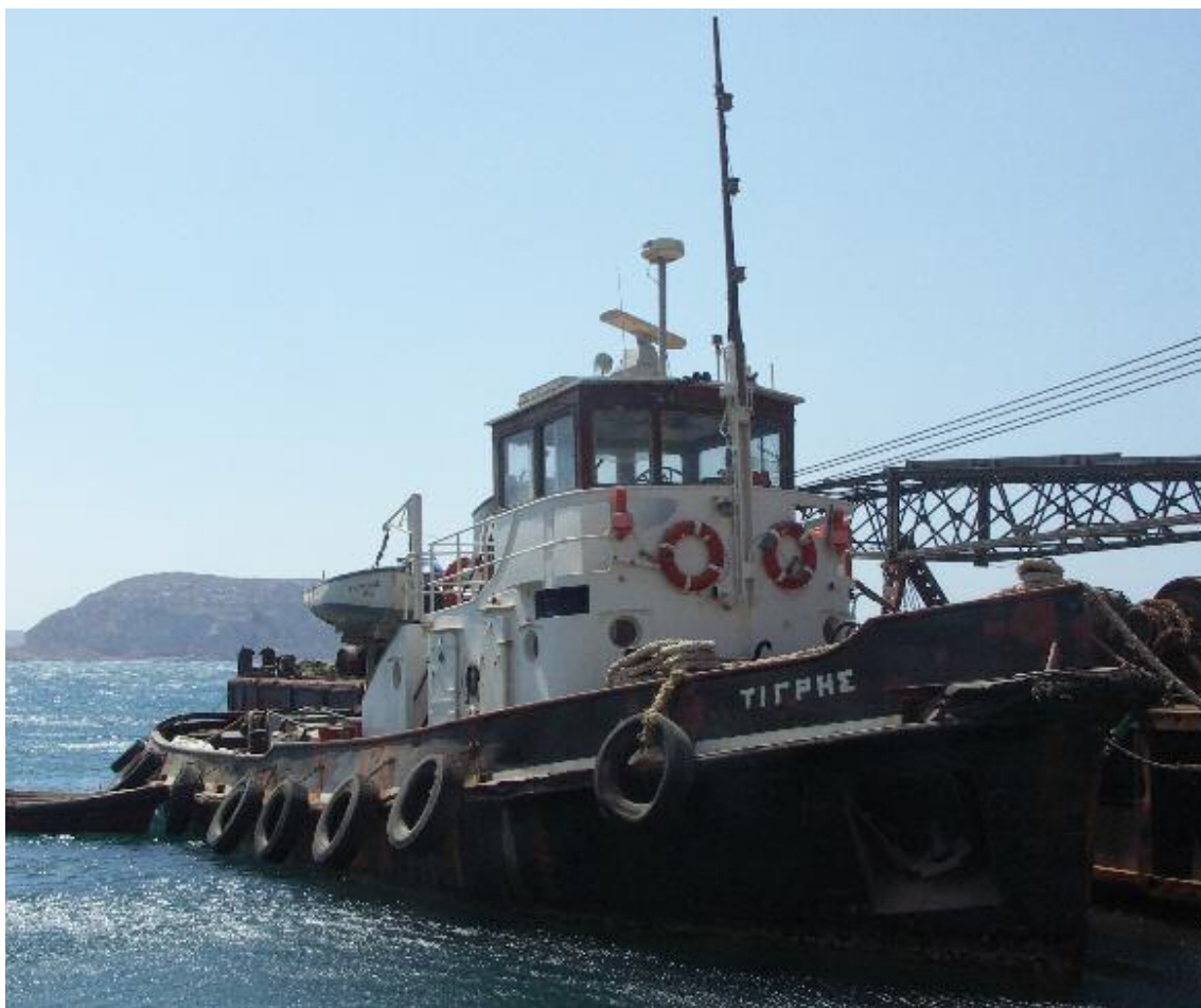
The former Dutch (van Ommeren) tug DRECHT seen in Finiki-Karpathos under the name TIGRIS