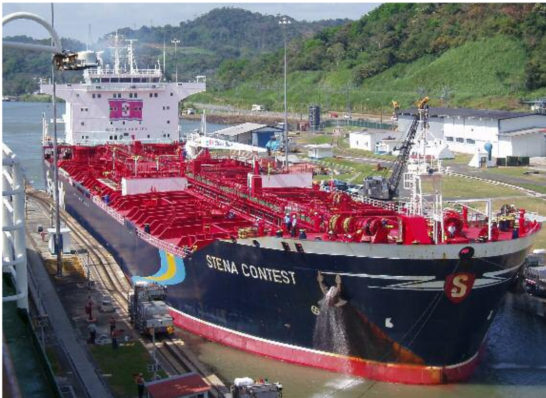
The STENA CONTEST seen entering one of Panama Canal locks

A celebratory Canadian-style barbeque was held for several thousand shipbuilders and dignitaries in Flensburg, Germany as Coastal Renaissance , the first of three Super C-class vessels begins preparations for its voyage home to British Columbia. To mark the completion of the first ship, an unveiling ceremony attended by Hon. David Emerson, Minister of International Trade and Minister for the Pacific Gateway and the Vancouver-Whistler Olympics, and Hon. Kevin Falcon, Minister of Transportation, Province of British Columbia, was held at FSG shipyard in Germany.