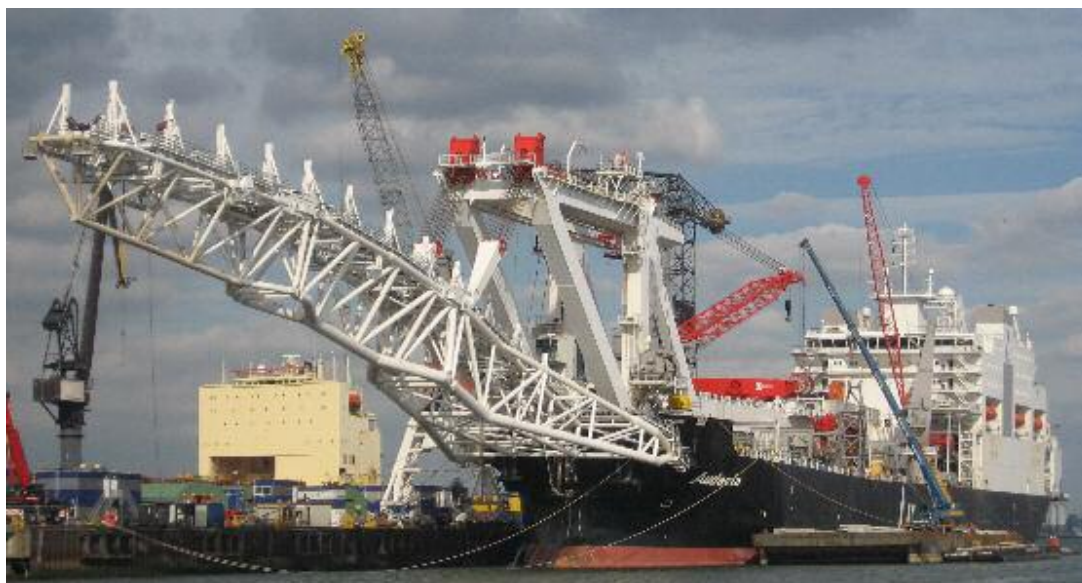
The AUDACIA seen at the Keppel-Verolme yard in Rotterdam-Botlek