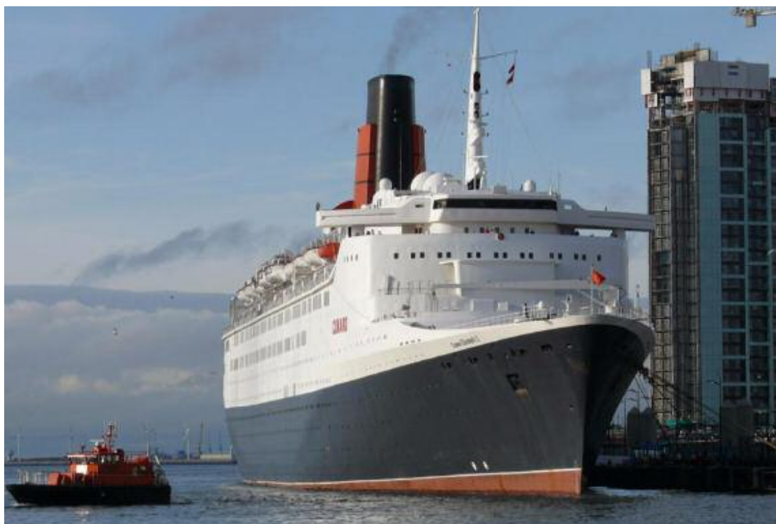
The QE2 along side the new Liverpool Cruise Terminal on September 21, 2007

market, we have considered it to be commercially prudent to dispose the floating storage facility given the attractive purchase offer.” The company currently leases 46,099 metric tons of land based storage capacity at Vopak in Singapore for fuel oil and blended products. The VLCC was originally acquired as a short-term measure to provide additional capacity until its terminal was completed. However, during Chemoil’s second quarter, the vessel experienced operational disruptions whilst stationed in Malaysian waters. The transaction through Chemoil’s wholly owned subsidiary, Anand Sea Shipping Limited, will result in a net gain for the Group’s current financial year with a corresponding increase in the net tangible assets. In the interests of upholding sound corporate governance, none of the directors or the controlling shareholder of Chemoil are related to Glory Town or have any personal interest in the disposal of MT Anand Sea . Jerome Lorenzo concluded: “The transaction has been a timely and profitable opportunity. We look forward to strengthening our performance in Singapore during the next quarter and increasing Chemoil’s long-term market growth within the region.”