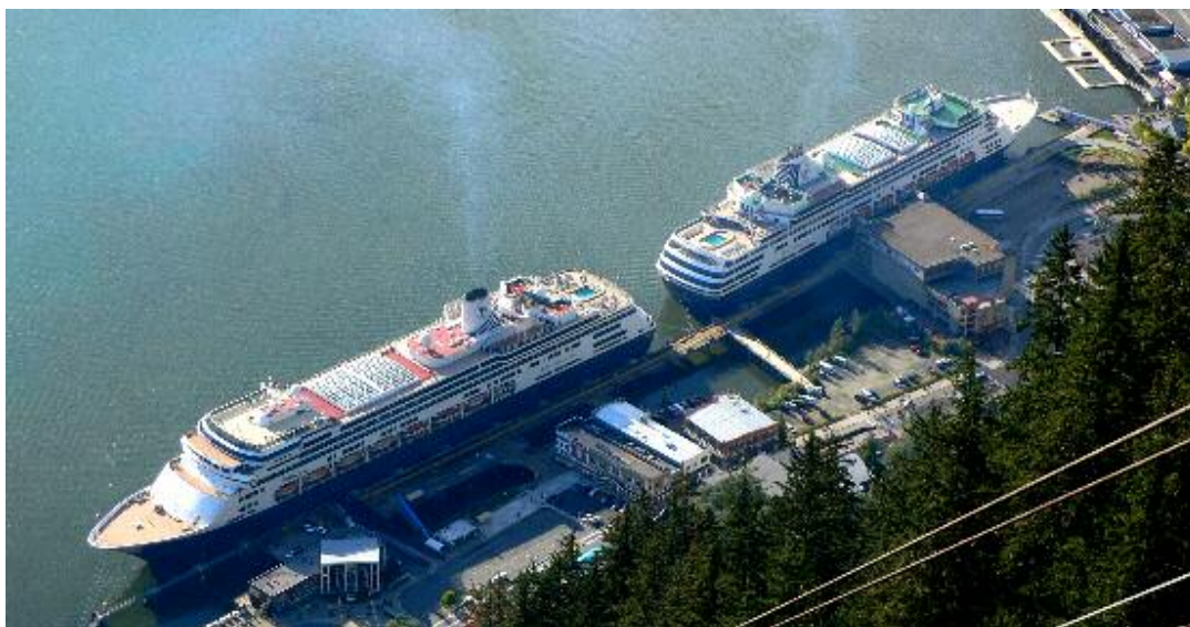
HAL's VOLENDAM and RIJNDAM seen moored in Juneau

Rotterdam wil in 2025 de uitstoot van koolstofdioxide hebben gehalveerd ten opzichte van 1990.