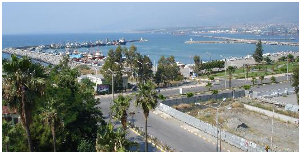
Top : The port of Iskenderun (Turkey)

When crewmembers saw Stanislov Gonkivskiy, 35, who had been working in the ship's hold, lying on the ground, they tried to revive him. In their attempts to help Gonkivskiy, the three of them along with Yuri Sherstyk, 34, were poisoned as well -- it is thought that the atmosphere below deck was dangerously low in oxygen.