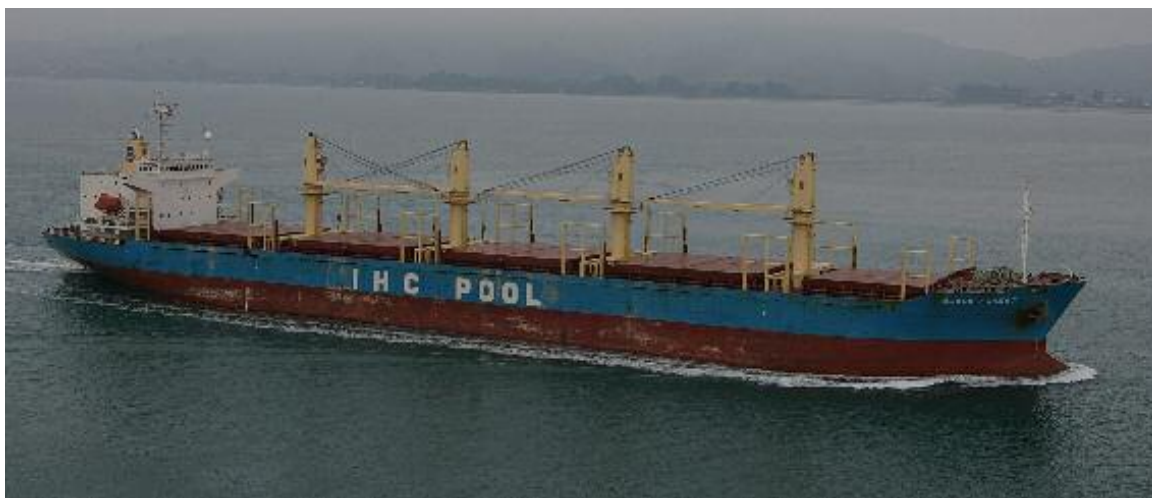
The BLACK FOREST 19887 gross tons registered in Hong Kong arriving Dunedin, New Zealand on the 22nd of September to load scrap metal