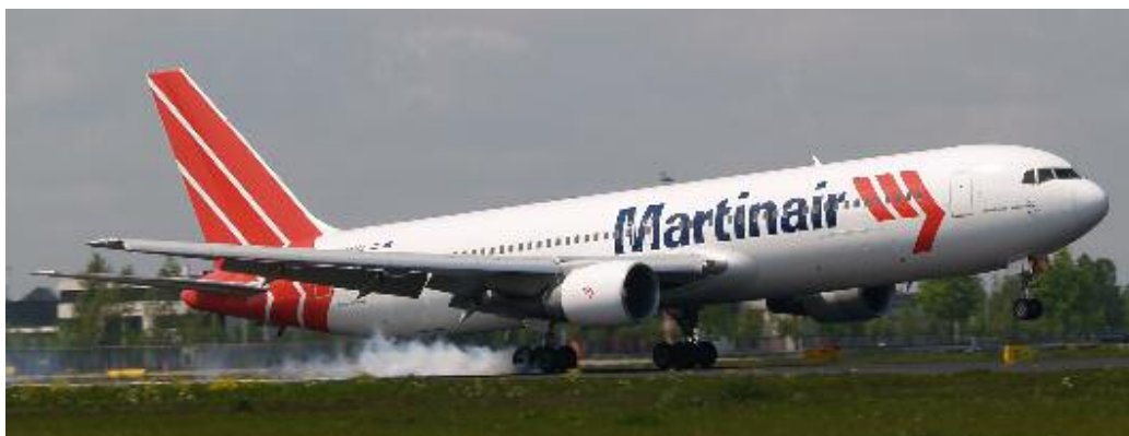
Martinair Boeing 767

Een woordvoerder van vakbond De Unie liet weten verbaasd te zijn over de vertrekregeling, die is aangeboden aan alle werknemers behalve die van de technische dienst. Volgens de zagsman is wel met Martinair gesproken over zo'n regeling, maar was er nog geen overeenstemming over de inhoud daarvan.