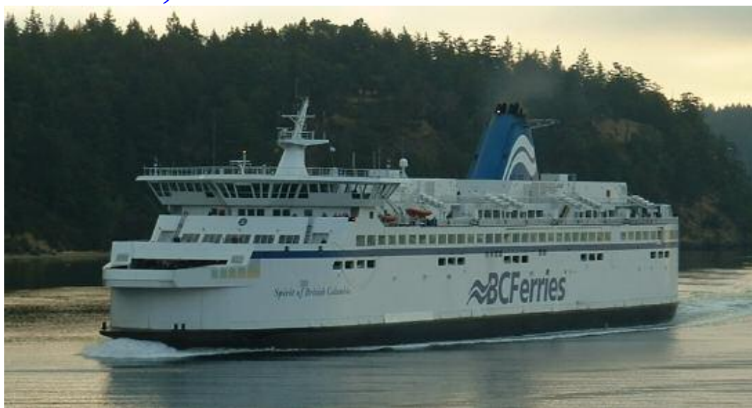
The " Spirit of British Columbia " transiting Active Pass en route from the mainland to Vancouver Island.