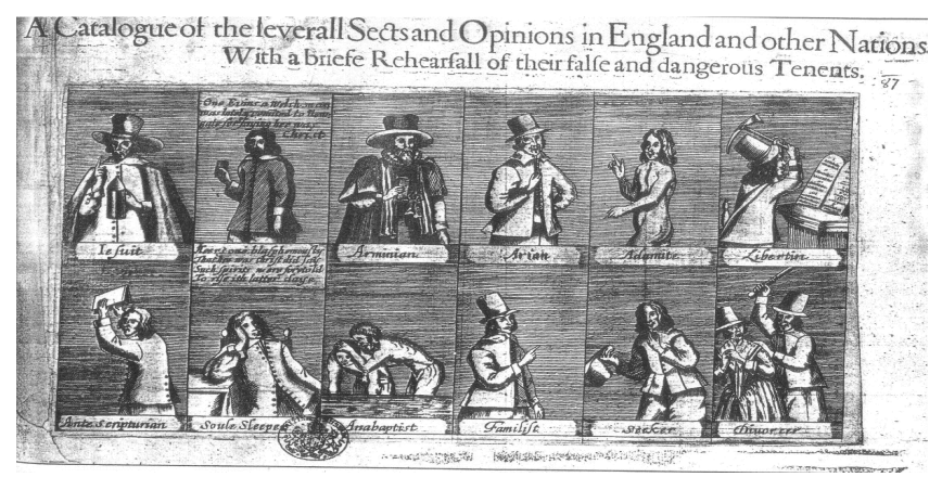
Figure 11. A propaganda broadsheet denouncing dissenters from 1647.

Following Twitter banning Trump Facebook followed suit interpreted by conspiracy theorists like QAnon supporters as yet another attempt by bigtech to silence "the truth". Since November 2020 Facebook had removed 60,000 related conspiracy pages, but people migrated to the messaging app Telegram, 8chan, and other platforms. One myth of this group is that of fighting paedophiles who in their belief control all the power. Believing in this offers certainty in an uncertain world: evil satanists are out to steal your children and Trump will save you. The peaceful inauguration of president Joe Biden on January 20 2021 demolished a central belief of QAnon that on that day Trump would declare martial law and all enemies would be executed. The media still craved more of the showman, predicting his return under the Patriot Party banner. Trump's return in May 2021 on the internet, initially foretold by his team as involving a new form of social media communication to dominate their foes, was a mere website. Facebook continued to prohibit the QAnon king a platform.