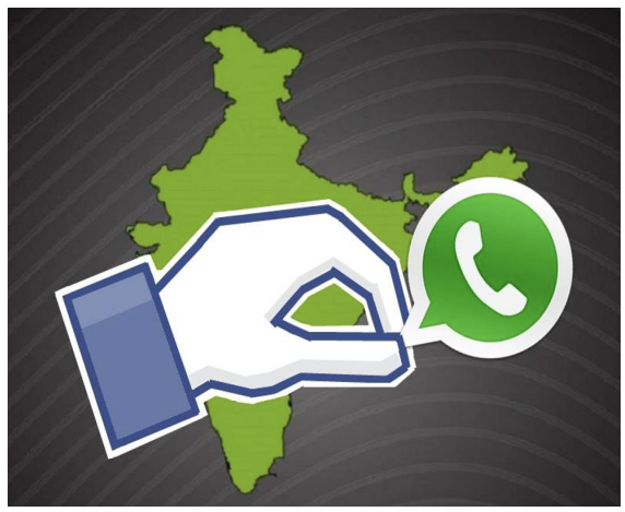
Figure 15. Map of India with Facebook and WhatsApp images.

Similarly, Indians have used Facebook owned WhatsApp to fuel vigilante behaviour. The government have attempted to intervene over privacy settings. India has over 400 million users of WhatsApp, the platforms largest market, the communications service used by approximately one-third of the planet (Iqbal, 2021). As with the UK, if the police are under resourced, people feel the right to take things into their own hands with an overt lack of faith in the legal criminal justice system. This leads to a form of machinic enslavement, informational technology a human-machine system (Deleuze and Guattari, 2011 506). Children are kidnapped to steal their organs and hoax videos are spread on Facebook and WhatsApp, such as false allegations of child sexual abuse. This form of communication technology breeds intimacy, fuels emotion, and spreads fear. Often here people have no other mechanism to examine the evidence to see what is true. One way of tackling this is to limit the number of people allowed in Whatsapp groups, this being five in India.