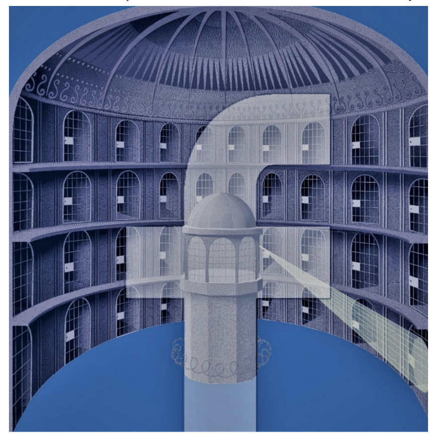
Figure 6. A 21st century panopticon called Facebook.

How much of life needs to be observed and streamed live, or is this a dystopian view as interpreted via the series Black Mirror (Charlie Brooker, 2011–)? Surveillance developments are part of the militarisation of the modern nation state (Dandeker, 1990). In 2003 US officials announced that American military operatives would be located in bases in Europe, focusing on child sex crimes and terrorist activity combined (Lee, 2005). These risk classifications, "infuse moral certainty and legitimacy into the facts they produce"; people then accept them as, "normative obligations and therefore as script for action" (Ericson, 1997 6). Any nuances of the human is anathematized, data holding a higher reality than the human. Simulation has been positioned as the critical contemporary category of social control rather than surveillance (Bogard, 2006). But can the two be divided?