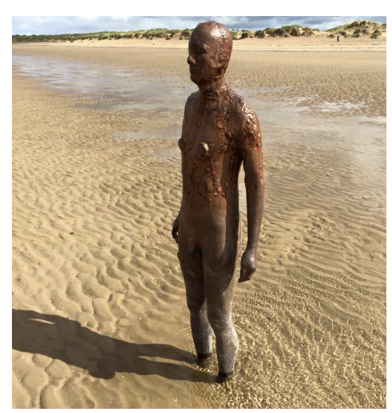
Figure 17. "Another Place" Anthony Gormley, Crosby Beach, Merseyside, England.

This article has argued that the extent of our personal inner surveillance, beyond subjective consciousness, differentiates us as humans. This can make us as human, along with our recognition of observation sub specie aeternitatis. "The crucial difference between 'the natural event and its appearance on the screen' is not physical but psychological" (Perkins, 1988 71). Perkins gone on to argue that film can never be "too lifelike" so long as we reinstruct our consciousness of the dissimilarity between film and reality so we are spectators not participants. Facebook vigilantism overcomes this division creating participants. The term reality has been used in this article to describe non-virtual reality, but it is problematic. Photography does not just record reality, it changes the "very idea of reality" (Sontag, 1986 87). While photography and cinematography changes reality, to fully believe it creates reality is still in some sense extreme, despite the fantasies of science fiction (Lee, 2015). Technology, "cannot duplicate reality because it cannot directly reproduce our perception of reality. What we see in the world is so much more a product of our will and whim than what we see on the screen" (Perkins, 1988 71). Behind this is an assumption that perception is reality and with Facebook's dominance via narrowing awareness through algorithms this can become the case leading to a myopic dehuman reality.