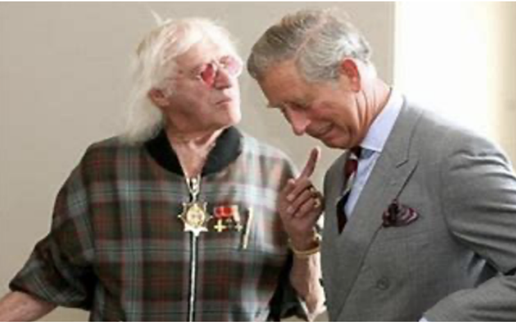
Figure 3. Prolific paedophile Jimmy Savlie with Prince Charles whose brother Andrew has been accused of paedophilia (Chandler, 2019) (Resort link to royal scandal snap | Otago Daily Times Online News (odt.co.nz)) (Lee, 2019).