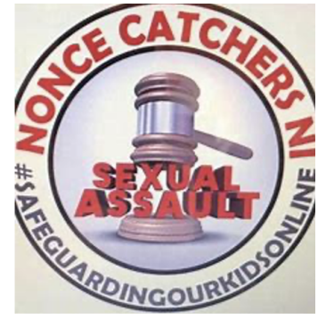
Figure 4. Nonce Catchers logo – nonce is a British colloquial term for a paedophile.

The legality of these groups and their methods have been questioned (Purhouse, 2020). In terms of the protection of privacy in July 2020 the UK's Supreme Court ruled that the, "reprehensible nature of the communications means they do not attract protection" (Brooks, 2020). In 2018 there were approximately 75 groups and by 2020 90 groups in the UK performing 100 hunts a month; during the first month of the first COVID-19 lockdown (from 16 March 2020) 16 incidents were recorded with 15 of these being "e-activism" (Dearden, 2020). Like a trophy on a wall in a hunting lodge, once caught the image and video of the hunted is displayed in the "paedo-gallery" on Facebook. Groups sometimes work collaboratively. One paedophile who thought he was dealing with five young girls in Wales was caught by five hunting groups (Day, 2020) (Five separate paedophile hunter groups caught out man trying to send explicit messages to underage girls - Wales Online). Another paedophile sexually communicating on Facebook with what he thought were girls as young as nine was caught by seven groups, his capture on Facebook Live (Cunningham, 2021) (https://www.edp24.co.uk/news/crime/paedophile-hunters-caught-michael-camp-diss-grooming-children-7070398).