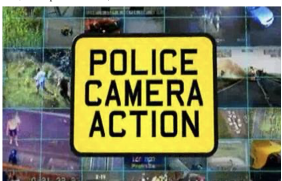
Figure 9. Title image from British TV show Police, Camera, Action!

As well as print and online media focusing on Facebook and paedophiles, TV has tackled the subject including group hostility and surveillance. For example, the UK's Dave Channel broadcast "Cops UK – Bodycam Squad" on 3 March 2019. This programme is one of many that fits within the genre "extreme television", early examples being ITV's Police, Camera, Action ! and Fox TV's World's Wildest Police Videos in the 1990s (Lee-Wright, 2010 139). Surveillance, entertainment, and the hunt again blurs. On the outskirts of Nottingham, England, in an under-priviledged area a police dog-handler with a body camera attends an incident at a shopping parade where a suspected paedophile is being held captive in a phone-box. Soon the baying paedophile hunting mob, with their phones inevitably weaponised, grows to around 20 screaming for vengeance. Items are thrown at the police officer who manages to get the hunted out of the phone-box. The officer requests for backup, who are slow to arrive, and he realises this is out of hand. This is all recorded on the officer's bodycam and the mobs' mobiles for our entertainment. The police officer rightly call this "a witch hunt".