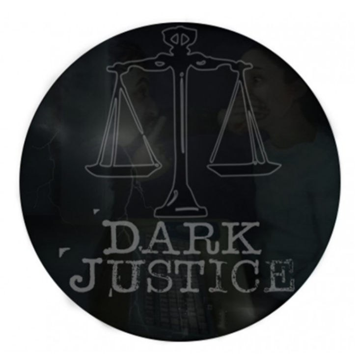
Figure 5. The UK's best known paedophile hunter group.

into Child Sexual Abuse (IICSA) in May 2019 that the police would not collaborate with these groups, but were still willing to receive evidence from them (D.5: Detection | IICSA Independent Inquiry into Child Sexual Abuse).