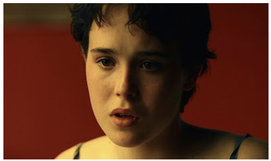
Figure 14. Elliot Page as Hayley in Hard Candy (David Slade, 2006).

For many this is essence of the American way; anything that stands in the way of this is anti-American and proof of their conspiracy. Where does this leave us in terms of trust? At least there is a movement in the right direction in the UK. In England and Wales confidence in local police rose significantly from 47 percent in 2003/04 to 62 percent in 2011/12 to 75 percent in 2018/19 (Confidence in the local police - GOV.UK Ethnicity facts and figures (ethnicity-facts-figures.service.gov.uk)).