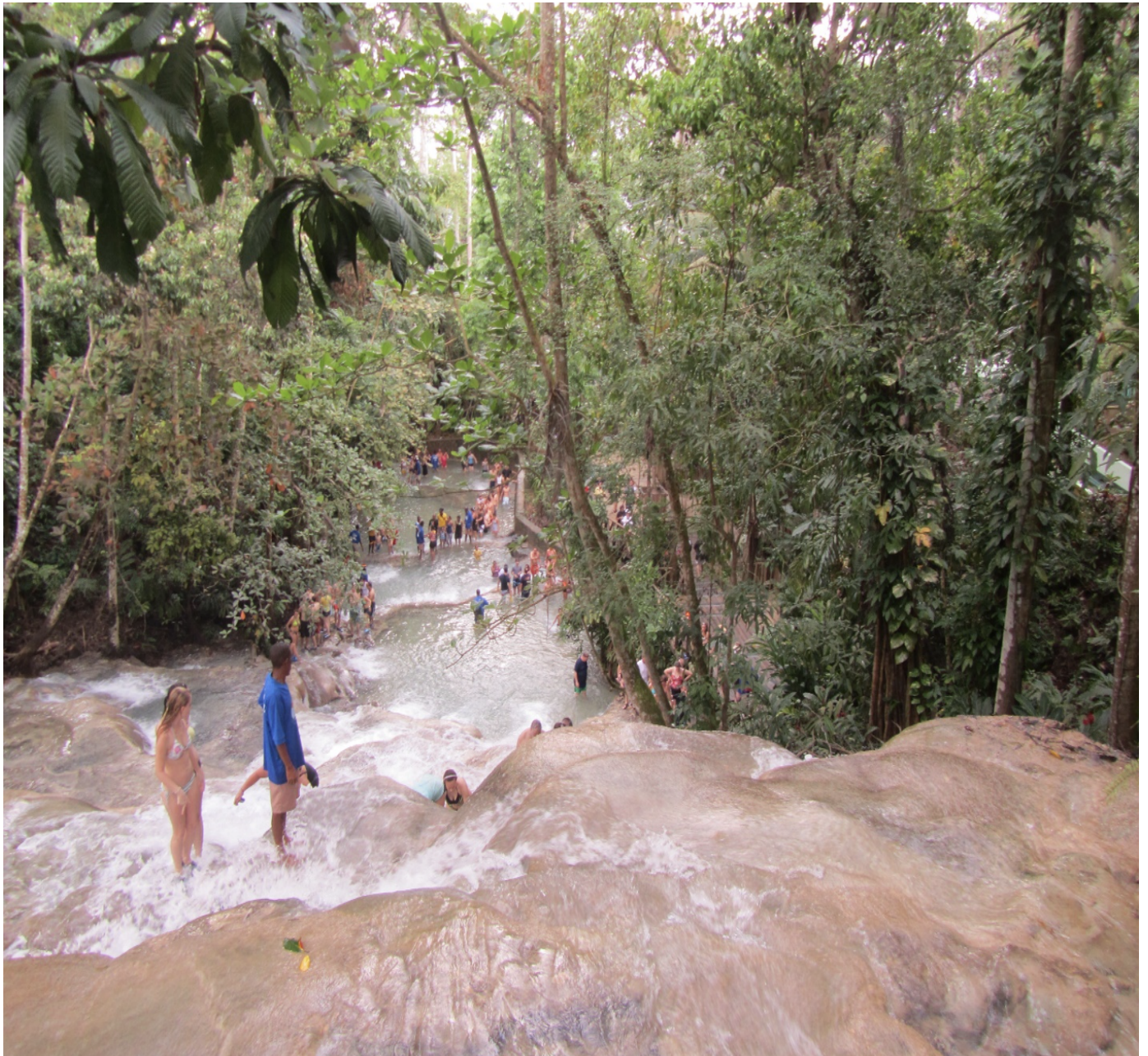
Figure 3. Dunn's River Falls, Jamaica.

The arrival of COVID–19 in Jamaica came with an announcement from Jamaica's Ministry of Health on March 10th, 2020 indicating that a Jamaican national had traveled in from the United Kingdom and tested positive for the virus (Nair, 2020). The government instituted numerous measures to mitigate against the spread of the disease, including a travel lockdown which negatively impacted its important tourism industry (The Economist Intelligence Unit N.A. Incorporated, 2020). As of May 7th, 2021, Jamaica was experiencing a peak of new cases at 723 with a 7–day average of 395. Total cases by March of 2021 were just over 26,000 with 453 deaths (Center for Systems Science and Engineering [CSSE] at Johns Hopkins University, 2021) (see Figure 4).