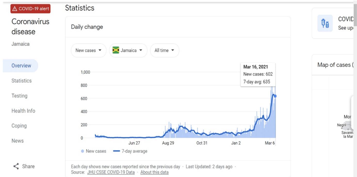
Figure 4. Graph showing COVID–19 cases in Jamaica (2021). Retrieved from https://www.google.com/ . Data from COVID-19 data repository by the Center for Systems Science and Engineering (CSSE) at Johns Hopkins University available at https://github.com/CSSEGISandData/COVID-19 .