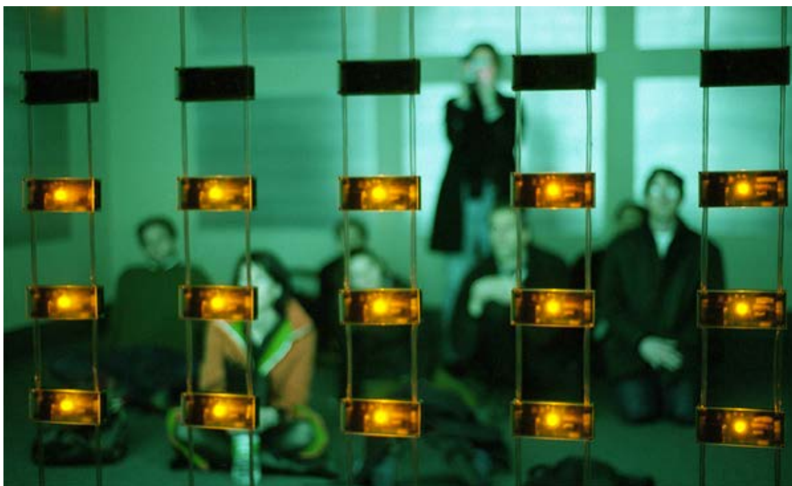
Figure 4. Early version of Listening Post in December, 2001, at the Brooklyn Academy of Music.

components we associate with the piece today (Hansen & Rubin, 2002). "In the end, the visual component of Listening Post acts as a kind of ventriloquist's dummy, which is animated by our sonic design" (Hansen & Rubin, 2002). It is fitting that the first two detailed reports from Listening Post by Hansen and Rubin appear in the Proceedings of the International Conference on Auditory Display. Listening Post , with its data-sonification roots, offers a multi-layer audio experience, consisting of mechanical noises, sampled sounds, synthesized voices, and a dynamic musical composition.