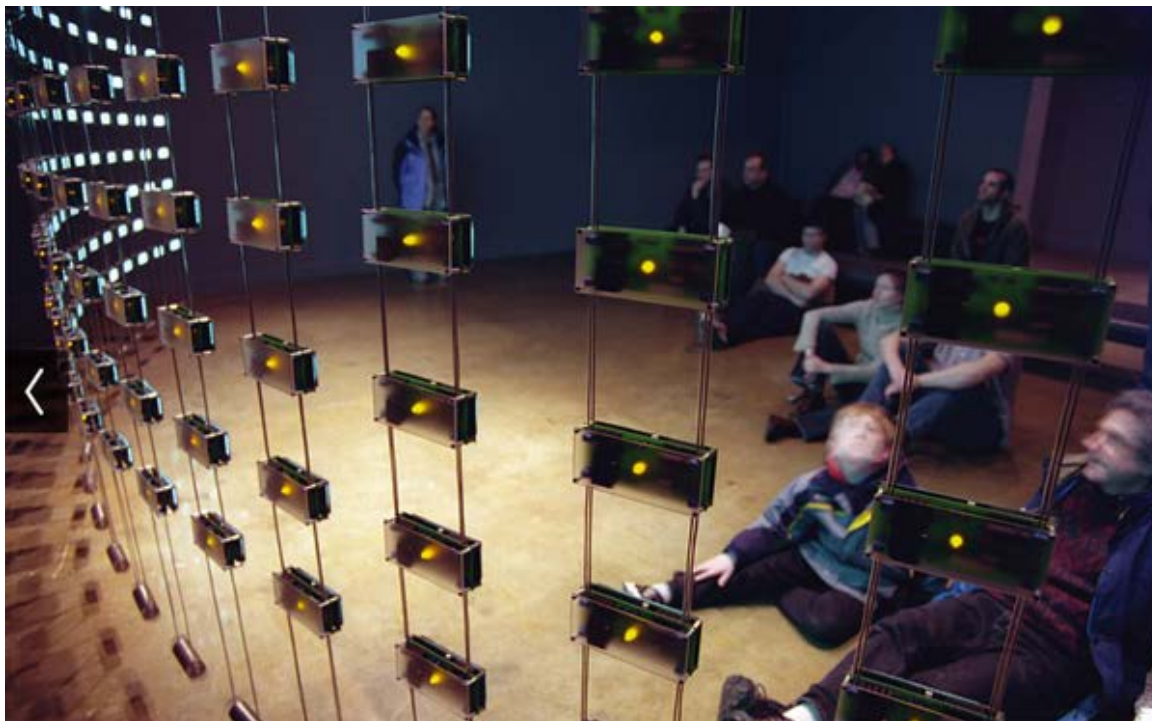
Figure 6. Listening Post at the MIT List Center for Visual Arts, Cambridge, Massachusetts, in 2004.