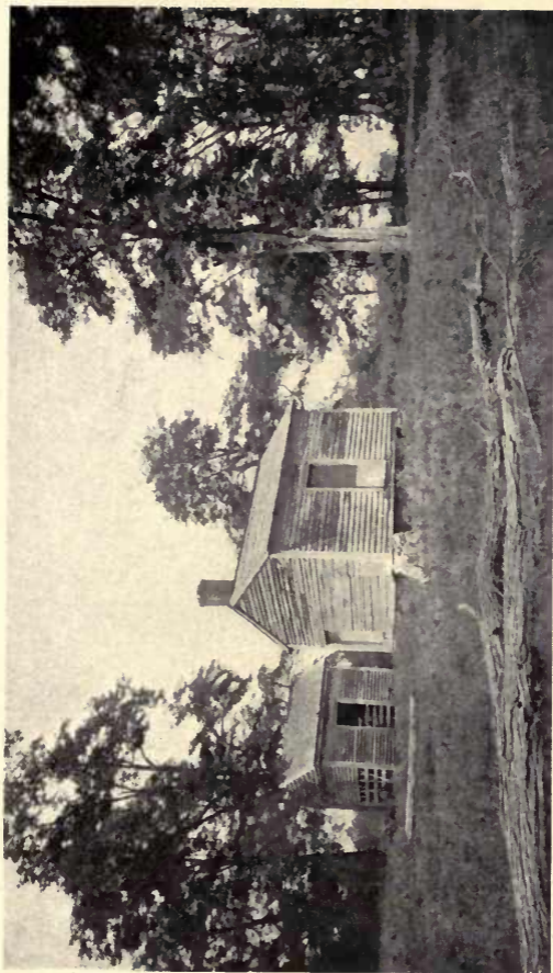
LAW OFFICE OF ATTORNEY-GENERAL JOHN BRECKINRIDGE AT CABELL'S DALE, BUILT IN 1793.