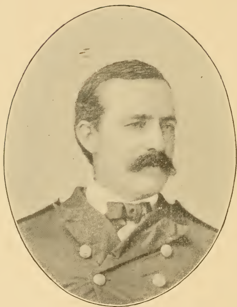
COMMODORE PHILIP INCH.