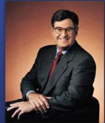
Sam Palmisano IBM Chairman and CEO

“Open standards must take hold in every industry. Without them, it's too difficult and costly to achieve the kind of transformation we've been talking about. I am not speaking just about technology standards, either. Standards exist in every industry, whether they are document formats, patient healthcare records, financial trading systems, security databases or inventory control systems.”