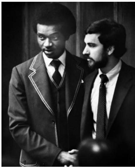
Film still from The Trials of Darryl Hunt

This Moment has been screened at numerous film festivals around the country including the Hamptons International Film Festival, the Harlem Film Festival, and the Women of Color Film Festival. Also on the shorts program is