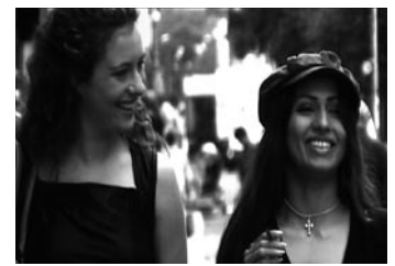
Film stills from This Moment (above, top) and Dreams & Passions (above)