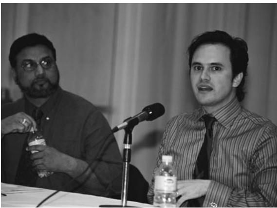
Identity Politics Reconsidered