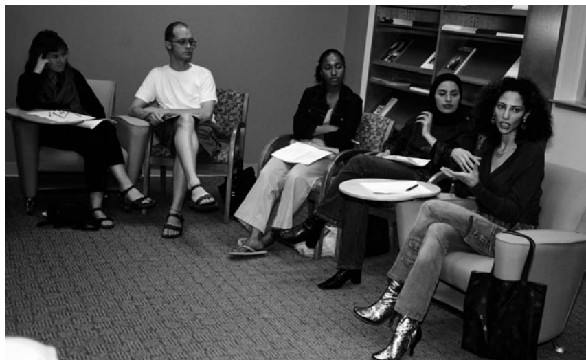
Suheir Hammad talks with students in the Stone Center Library