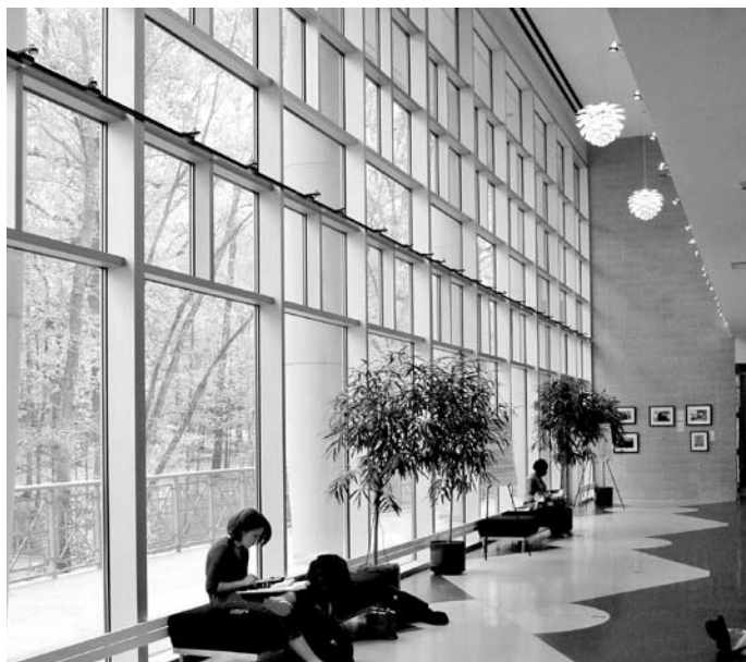
Stone Center Lobby

To make an immediate gift to the Center, complete and mail in the donor support form on the back or visit the Stone Center website at www.unc.edu/depts/stonecenter click on 'make a gift to the center'. ■