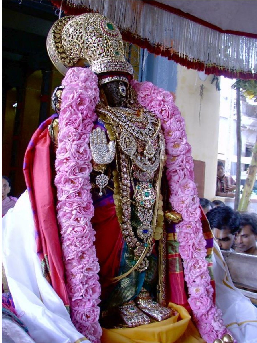
Parthasarathi emperuman with scars on his face

from Bheeshma's Bow by taking them on his face. Even today Utsava Murthy Parthasarathy Perumal's face could be seen with the scars of the arrows.