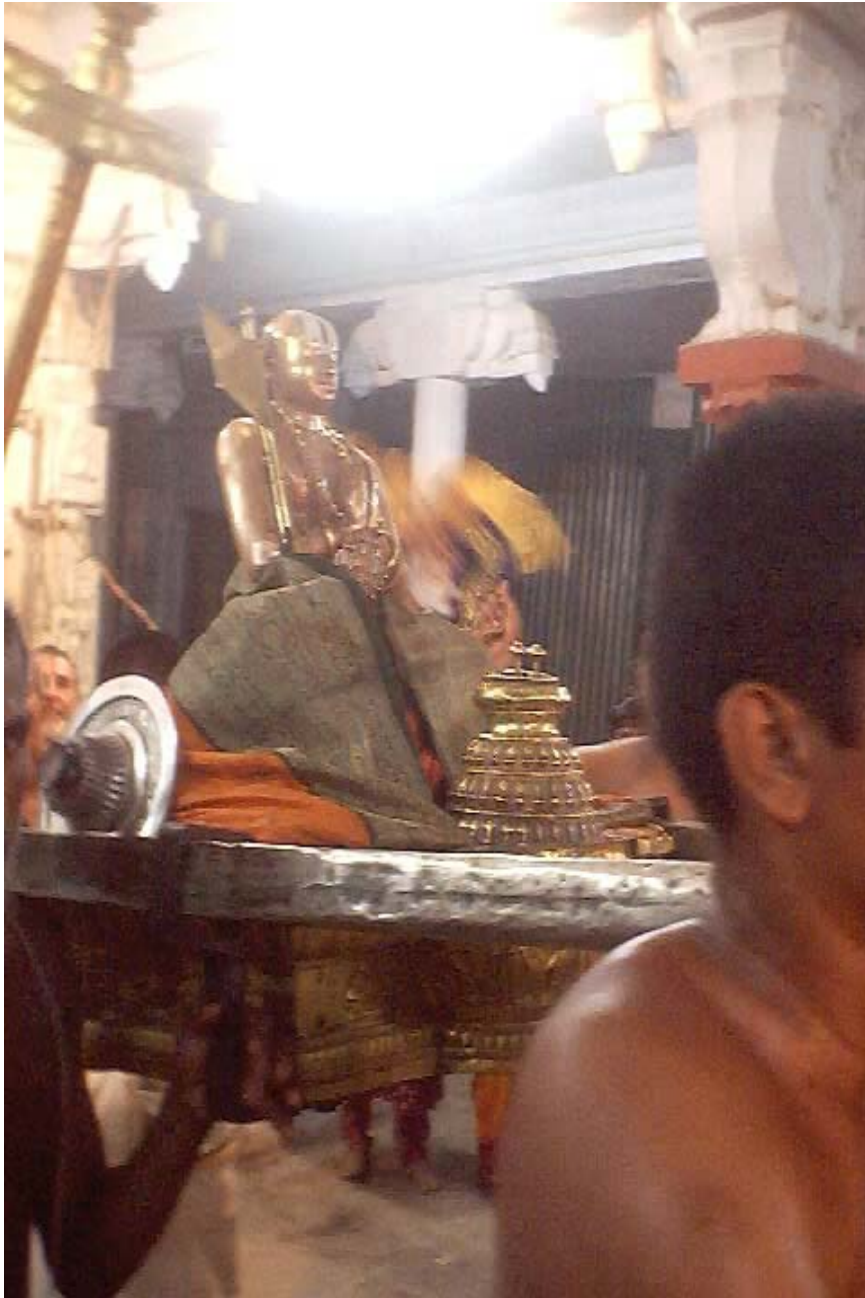
Swami Ramanuja @ Sri perumbudUr during the grand festival