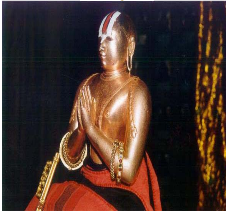
Sri Ramanuja in Thirunarayanapuram

A VEDICS JOURNAL Volume 1 Issue 2: Apr - Jul 2003