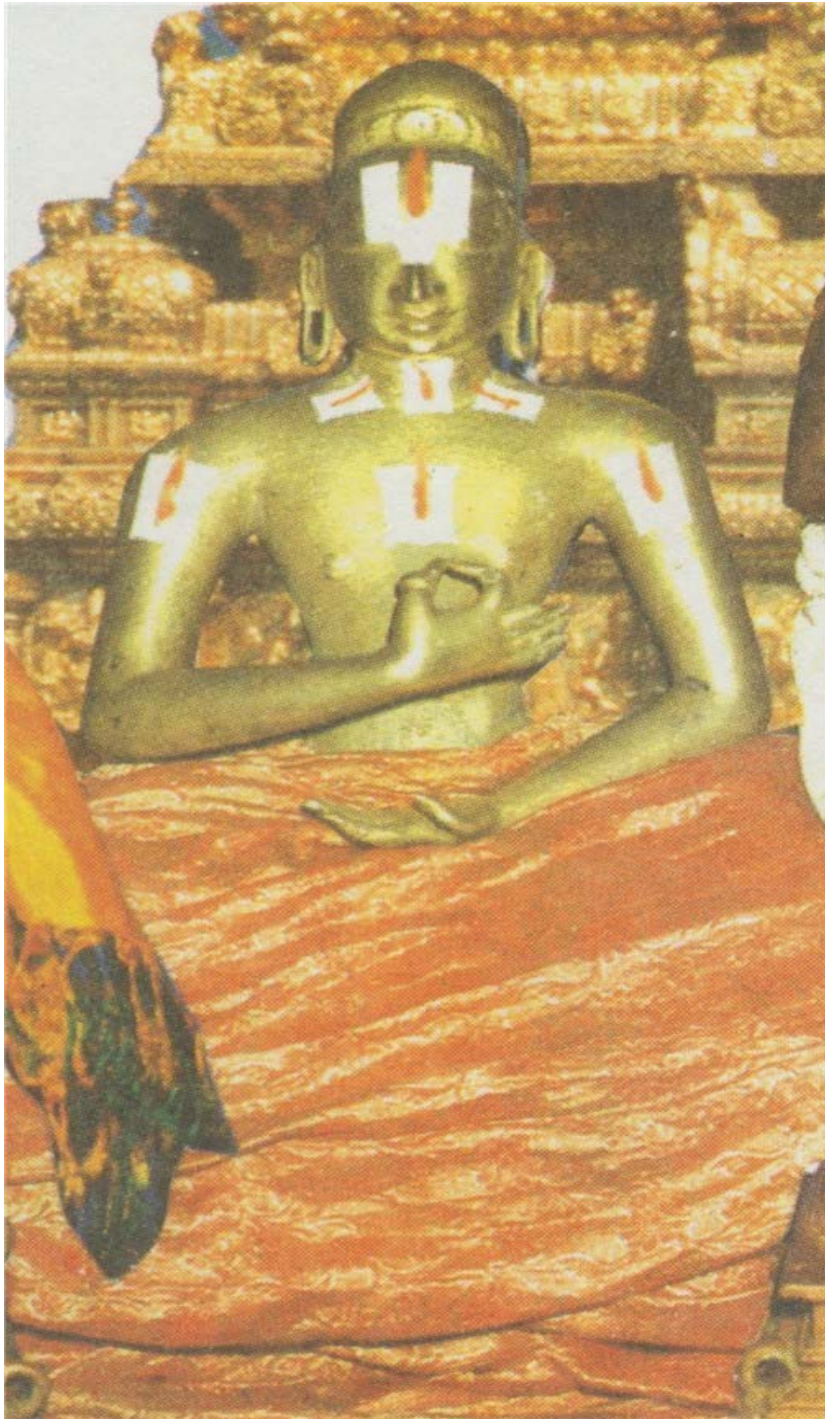
Svami Nammazhvar at Kanchipuram