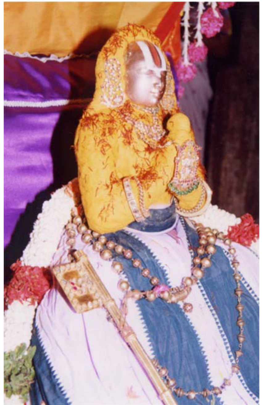
Swami Ramanuja @ Melkote during the grand festival