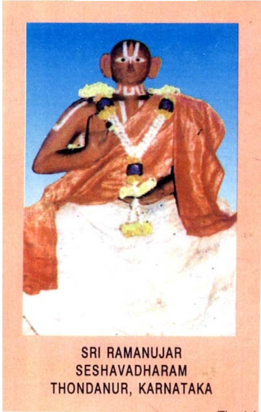
SRI RAMANUJAR SESHAVADHARAM THONDANUR, KARNATAKA

A VEDICS JOURNAL Volume 2 Issue 3: Jul - Sep 2004