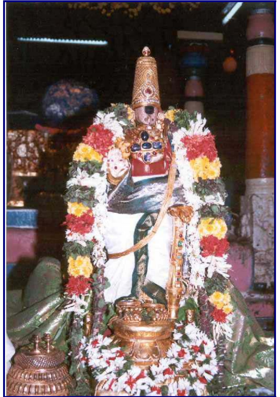
Swami namperumAL

The beauty of Lord Ranganatha is incomparable. He possesses the kind of classic beauty that made Azhvars, AchAryAs, and Sri parASara bhaTTar feel and promise if paramapathanAthar's (the lord in Sri vaikunTam) forehead doesn't bear thirunAmam (the holy mark on the forehead) and the broad bewitching smile, "I'll certainly come back to Srirangam" Hence His beauty and mercy are beyond description. One more reason for the gleam on his face is due to the service rendered by acharyas. There is absolutely no doubt in this.