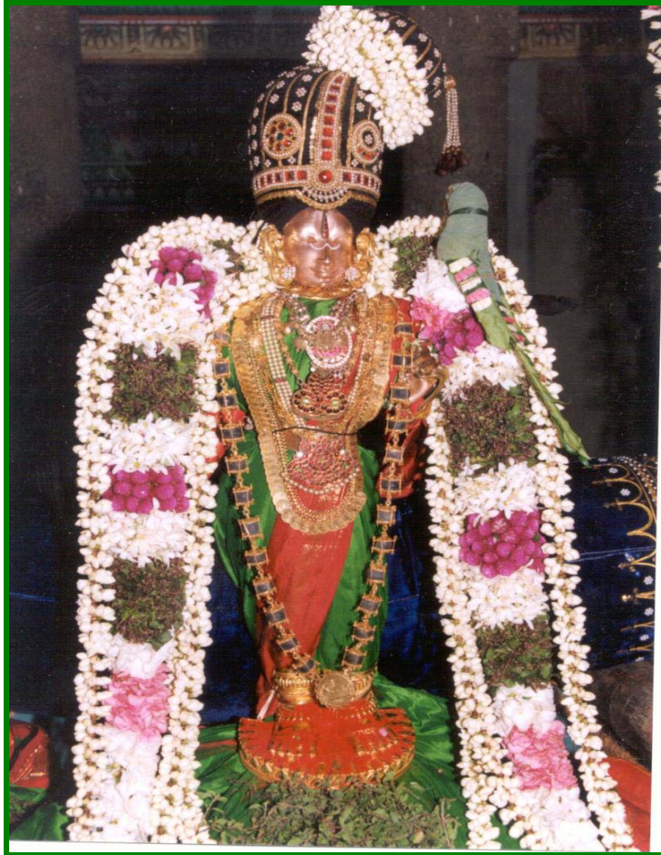
ANdAL

Let us all, therefore take refuge in, and surrender to Sri Ramanuja.