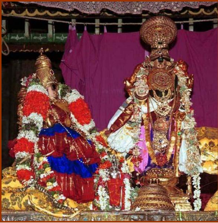
Namperumal and ranganayaki thayar on panguni uthiram sErththi sEvai