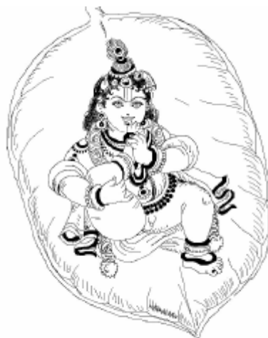
"allai vilaita perumAn"