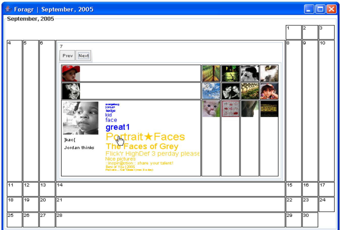
Figure 1: A screen capture of the Foragr browsing interface. The user has zoomed in on a an interesting photo from September 7, 2005 and is browsing the tags applied to this photo and the public groups in which the photo appears