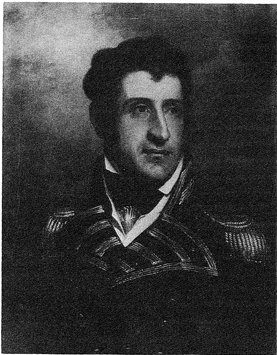
CAPTAIN STEPHEN DECATUR, JR., U. S. NAVY.