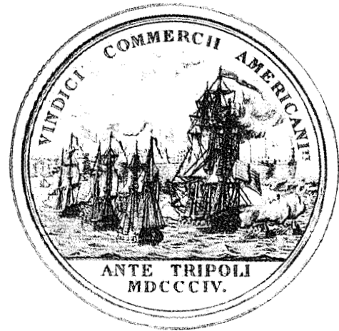
MEDAL PRESENTED BY CONGRESS TO COMMODORE EDWARD PREBLE.