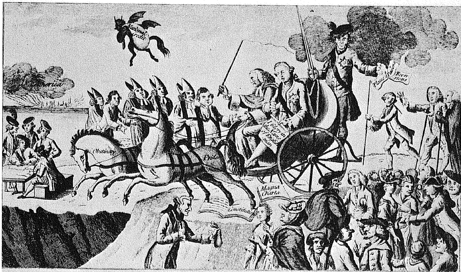
The Political Cartoon for the Year 1775.