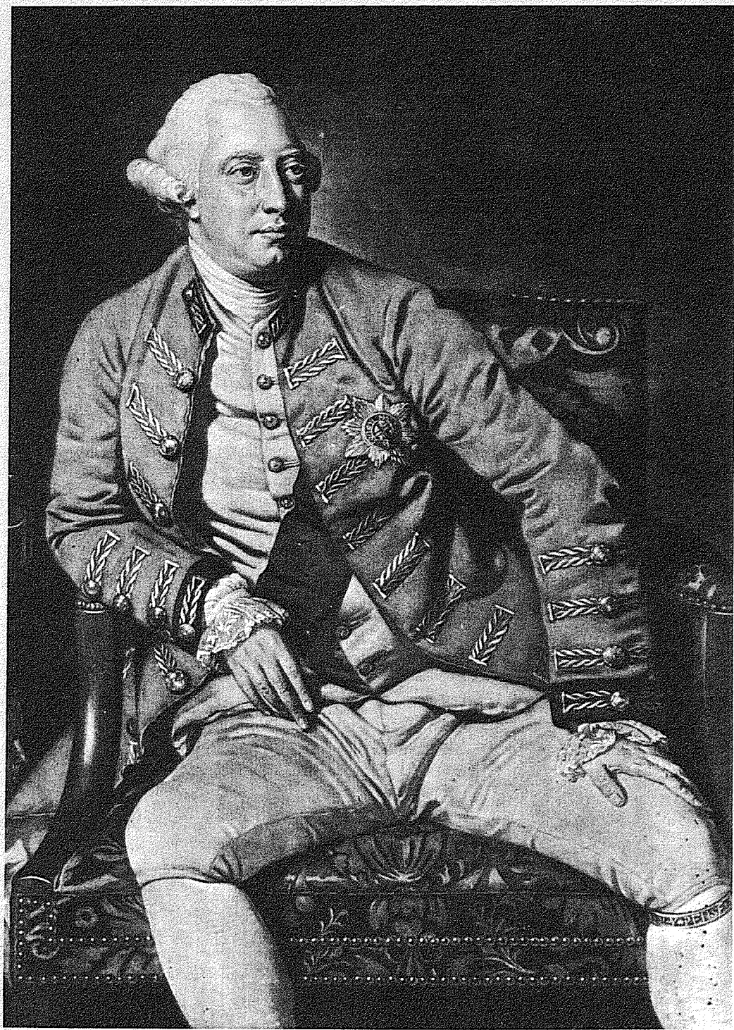
George III. By Richard Houston, 1772.