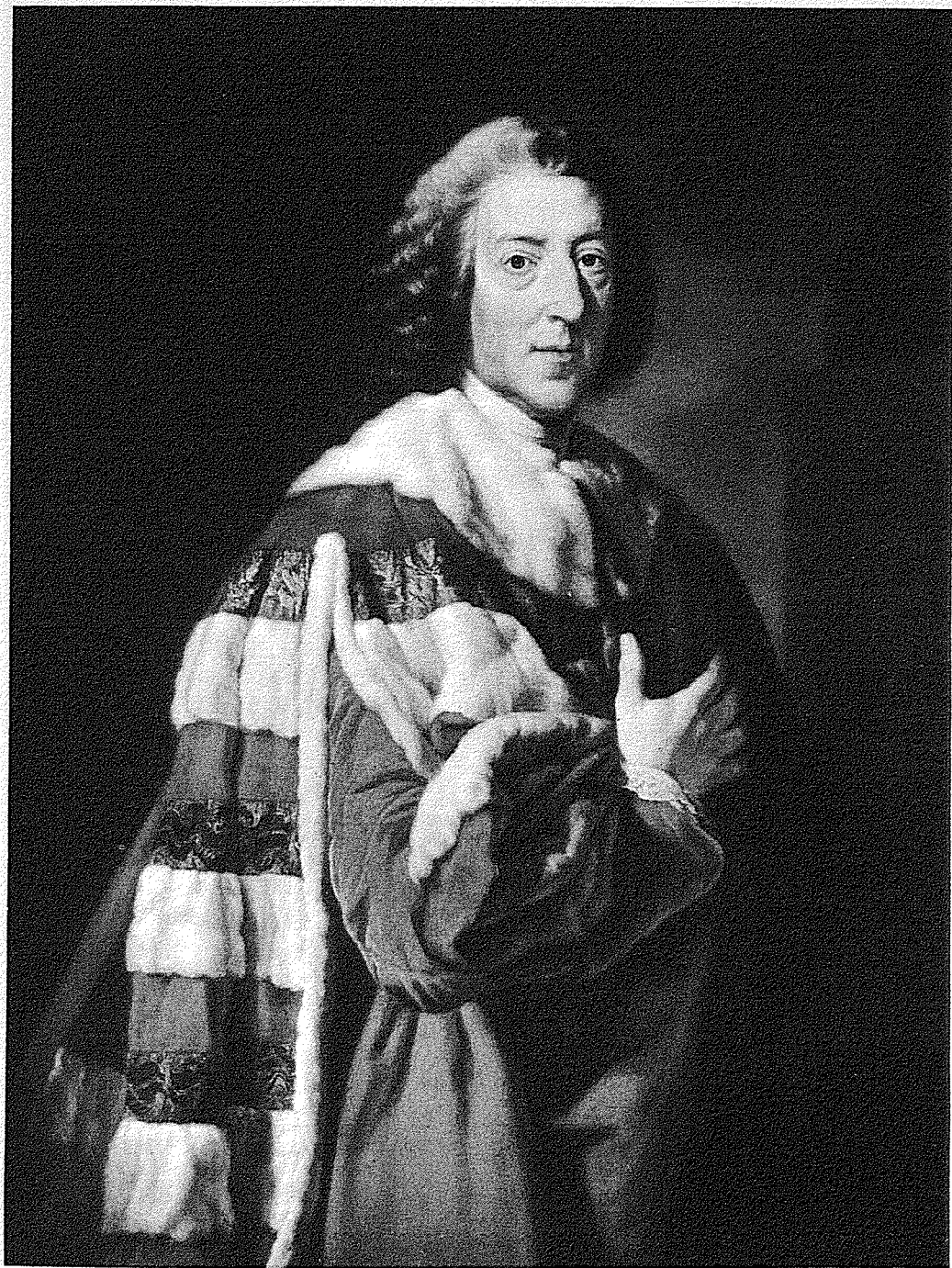
William Pitt, First Earl of Chatham. From the studio of Richard Brompton, 1772.