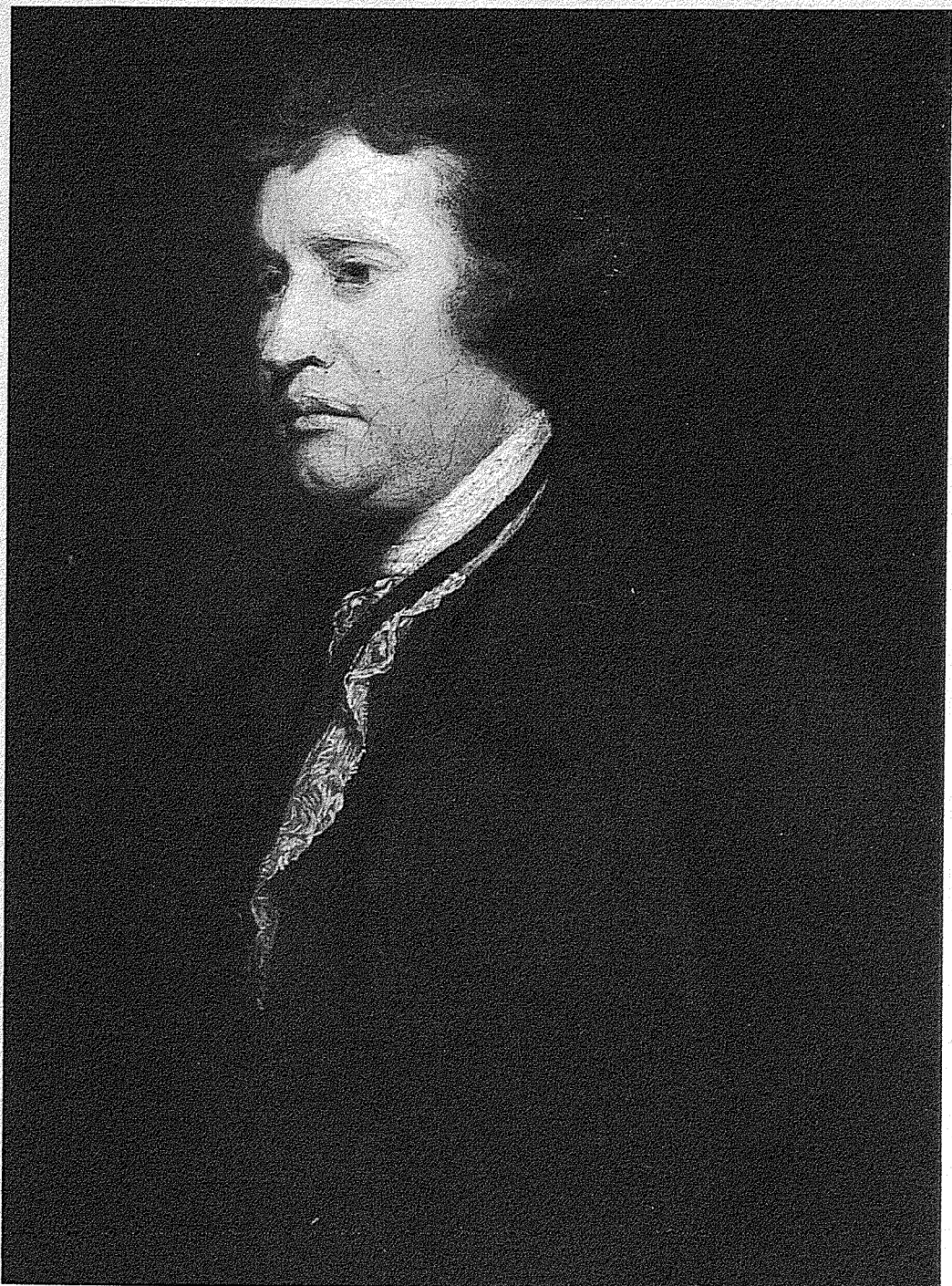
Edmund Burke. From the studio of Sir Joshua Reynolds, 1771.