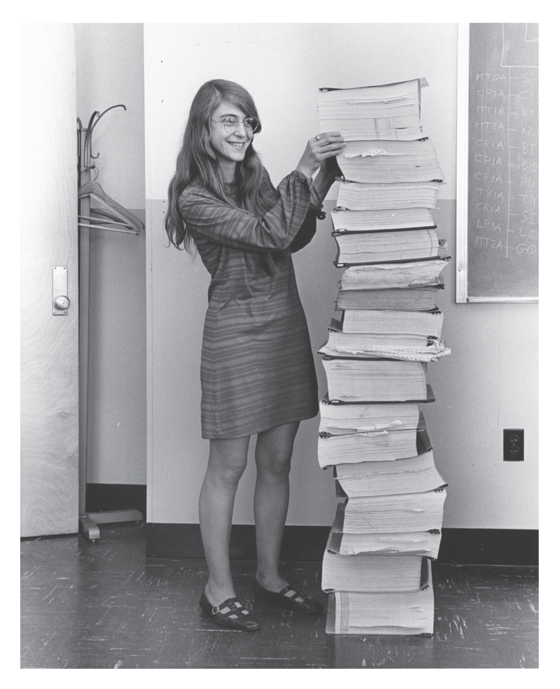
Figure 3 . Margaret Hamilton standing next to stack of Apollo Guidance Computer code.