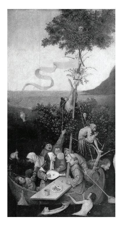
Figure 1. Hieronymus Bosch, Ship of Fools (1490–1500)