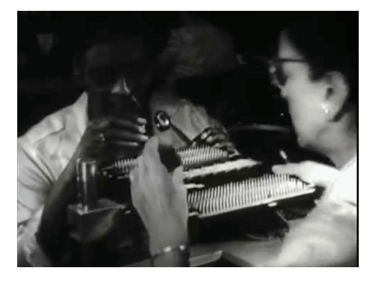
Figure 2 . Teamwork was required to braid the wires through the cores. Screenshot from Computer for Apollo , directed by Russell Morash (Cambridge, MA: MIT Science Reporter, 1965).

Figure 1 . A Raytheon employee creating Apollo rope memory. Screenshot from Computer for Apollo , directed by Russell Morash (Cambridge, MA: MIT Science Reporter, 1965).