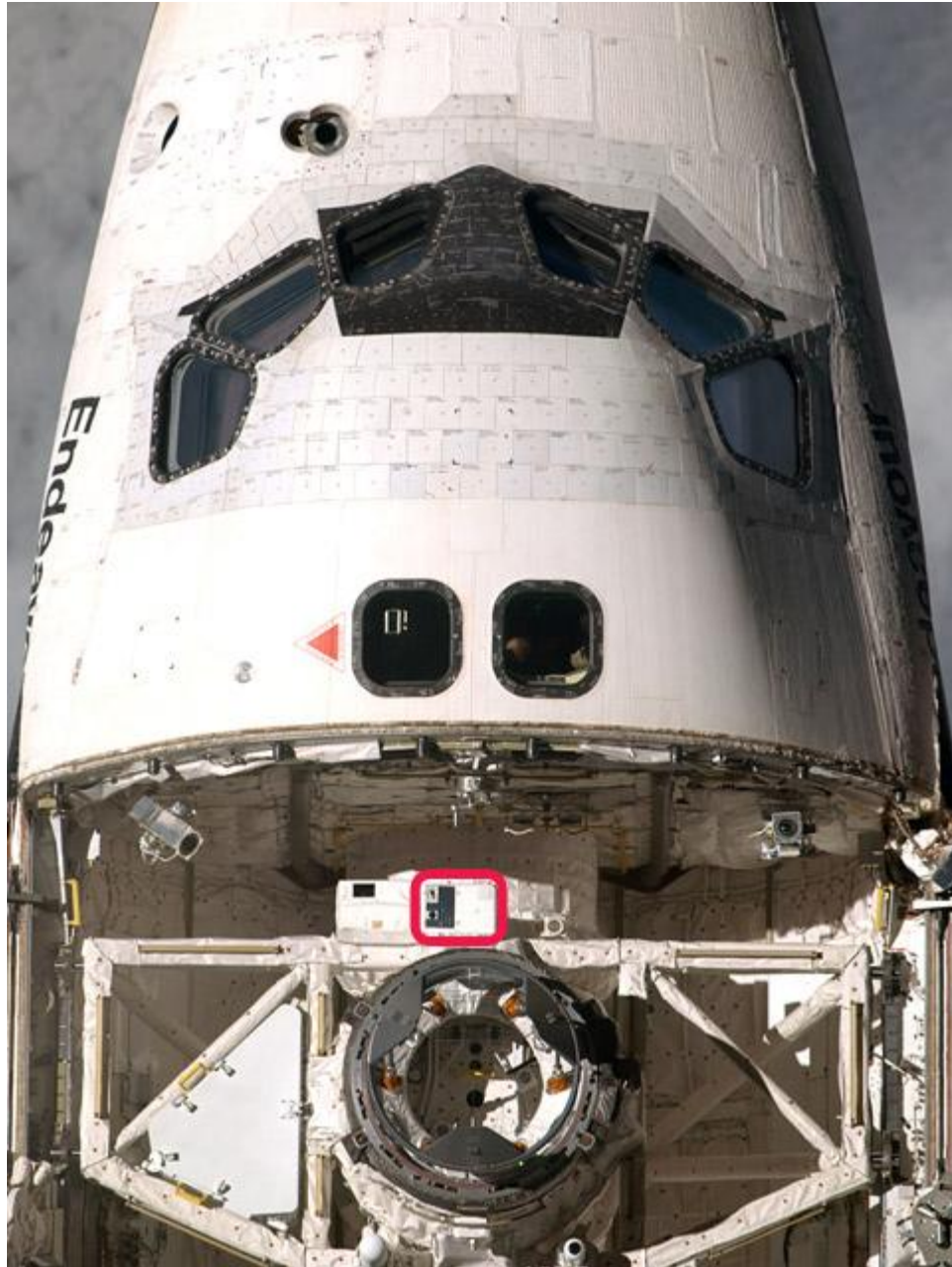
DragonEye Mounting to ODS on Endeavour