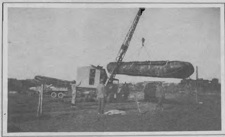
Method of pre-inflating pontoons and loading on dump trucks used in Roer Crossing.