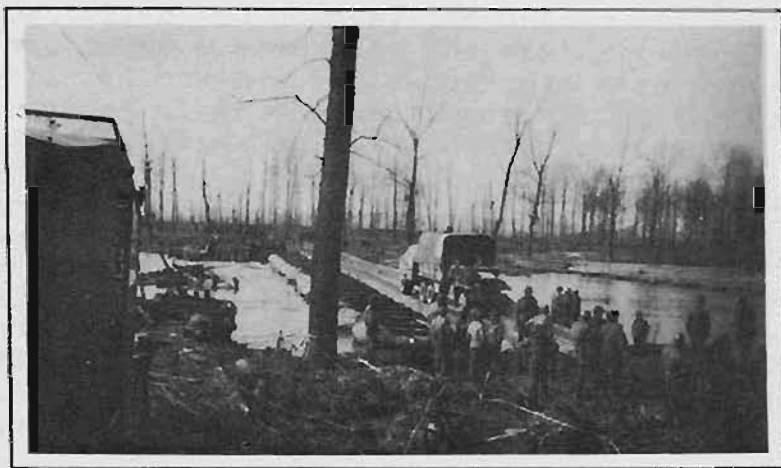
Completed bridge built by 246th Engr C Bn and 992 Engr Tw Br Co.