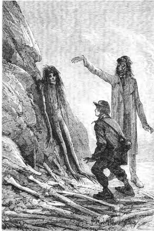
Figure 2. "A perfectly recognisable human body," by Riou, in ch. 37 of Jules Verne's Journey to the Centre of the Earth (1864, 1867).

déluge (pp. 326–328 and 340–342), although Figuiet makes more explicit Peter Camper's role in the controversy over Scheuchzer's pre-Adamite witnesses of the Flood. At the same time, Verne entertains the reader by a variety of literary devices, such as employing Axel's point of view to mock Lidenbrock's over-academic style. In sum, this passage would on its own provide conclusive proof that Verne borrowed from Figuiet in writing the novel.