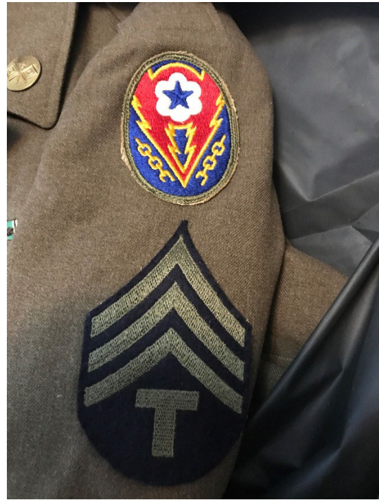
Advanced Section Communications Zone Shoulder Patch T4 Stripes