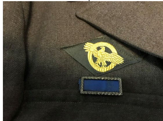
TOP: Honorable Discharge BOTTOM: Presidential Unit Citation