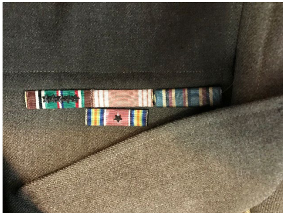
TOP: European/African/Middle Eastern Campaign Medal with five stars for the Normandy, Northern France, Ardennes-Alsace (Battle of the Bulge), Rhineland, and Central Europe Campaigns, Good Conduct Medal, WWII European Victory Medal (Original Design), & American Campaign Medal