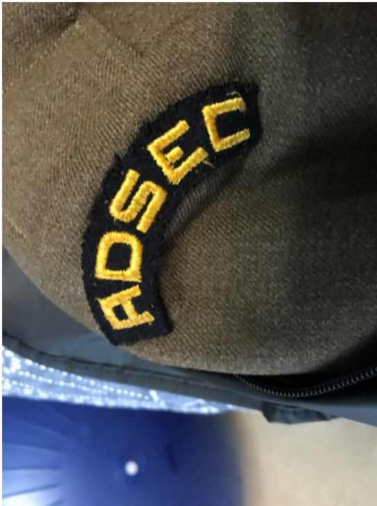
Shoulder: Advanced Section Communications Zone