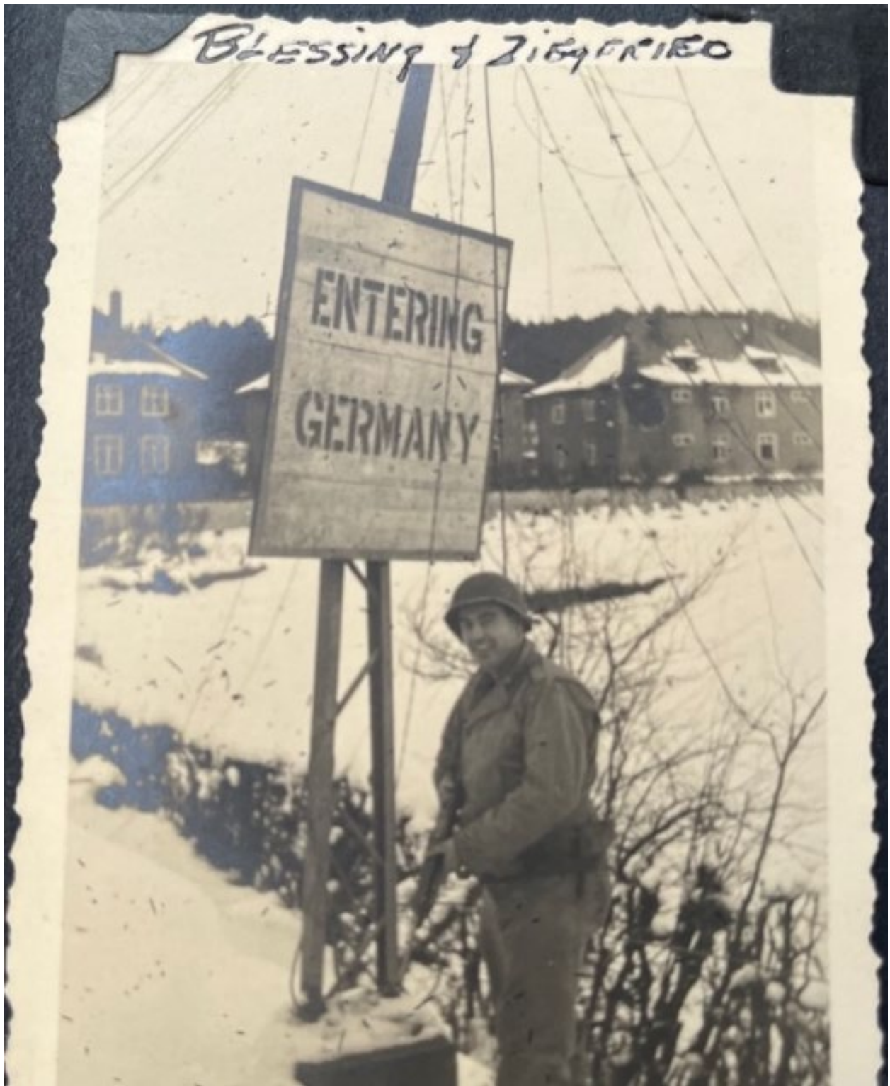
Entering Germany East of Veviers, Belgium October 1944