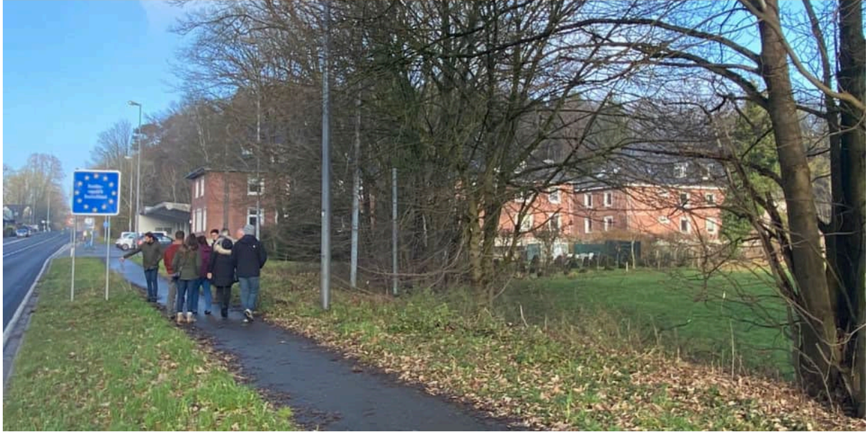
East of Veviers in Germany TOP: 1944; BOTTOM: 2021