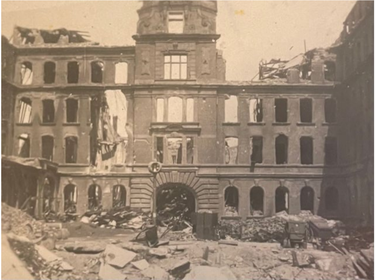
Frankfurt Telephone Exchange