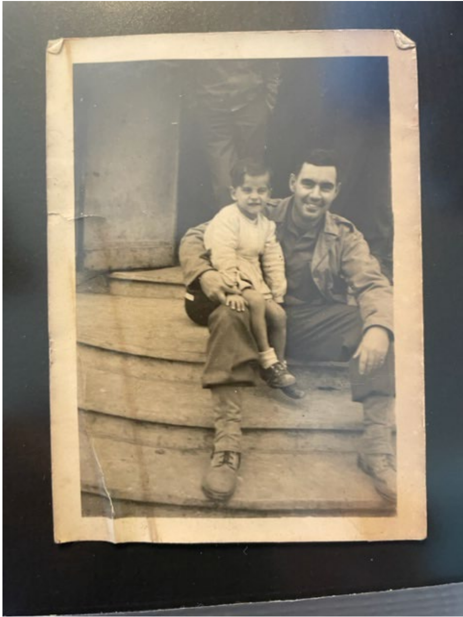
Reims, France, around September 1944