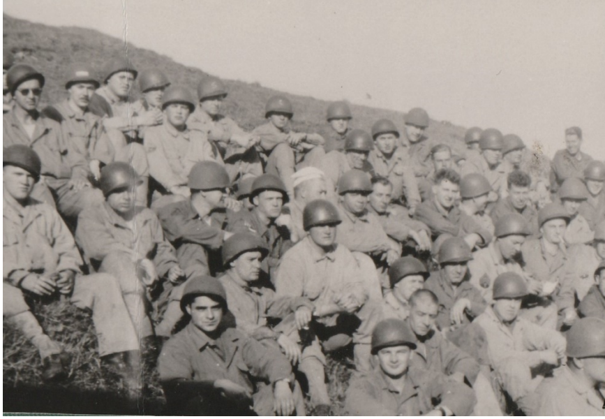
Unconfirmed if members of the 3253 rd .