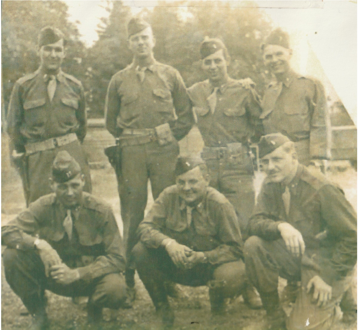
Unconfirmed if members of the 3253rd